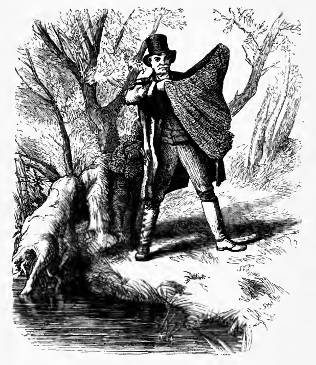
A COAL-HEAVER MAKING AN EXPERIMENT IN FISHING.

with their shoes full of dirty water, they swing themselves round like a coal-heaver, and with a sudden jerk plunge the net into the water in