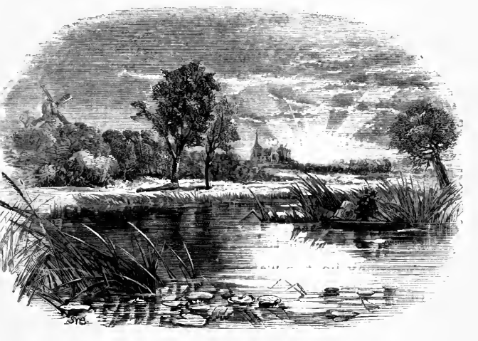
SETTING THE BOW NET.

the stream be too deep for the plan I am recommending, you must have your nets of a larger size. Have the splints of your bow net painted green, like the general colour of the weeds: