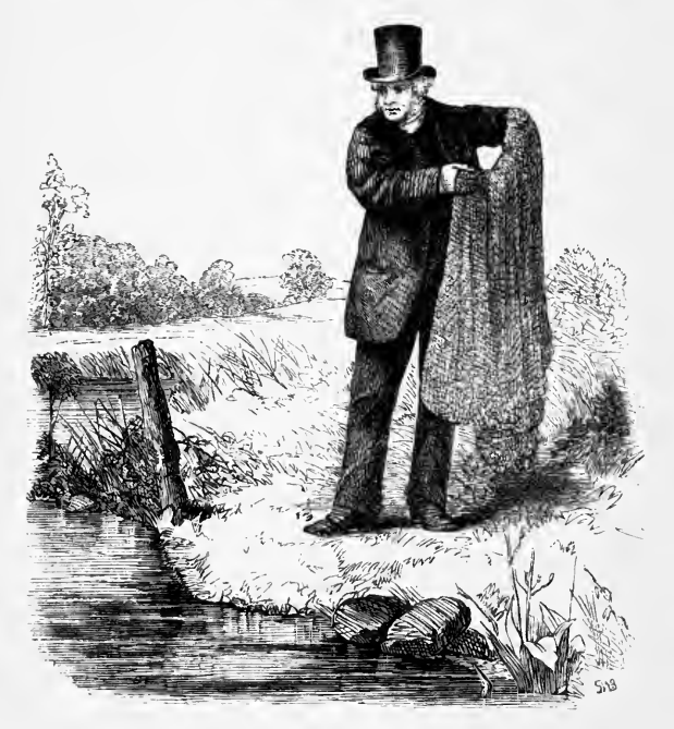
THROWING A CASTING NET.

he now stands up erect and poises the net; then gently leaning his body to the right, as, pendulum fashion and with as much truth and evenness, he backwards and forwards swings the net, and then