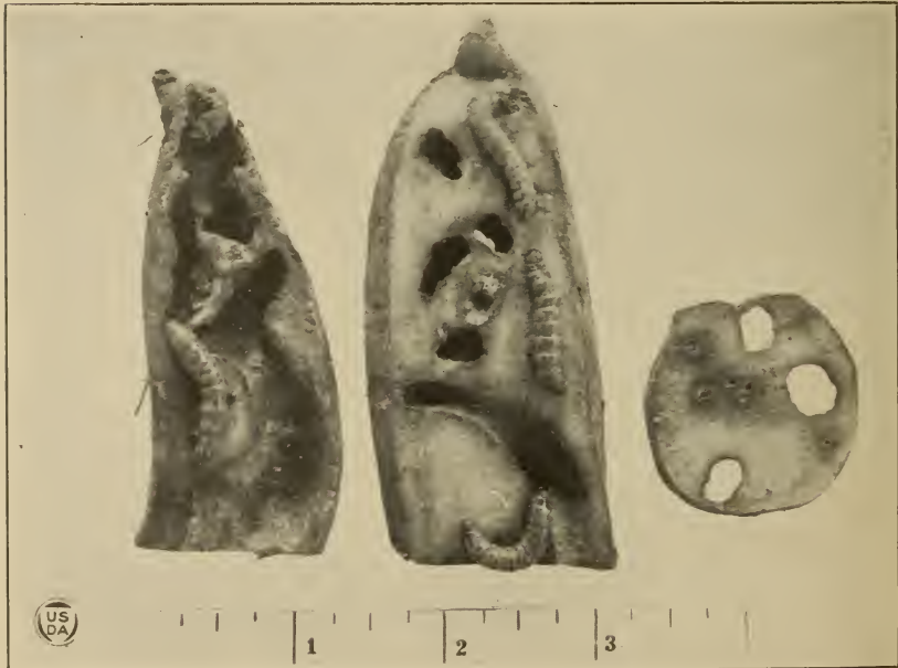
FIG. 2.—SWEET POTATOES BADLY DAMAGED BY STEM BORERS.