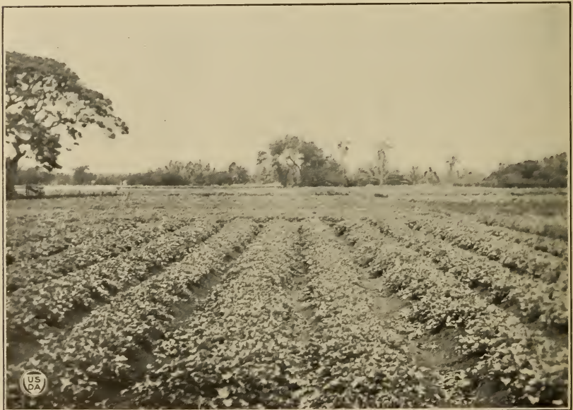
FIG. 2.—SWEET POTATOES GROWN BY RIDGE METHOD.