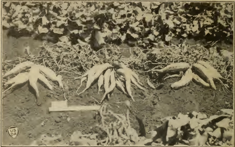
FIG. 1.—HILLS BEARING SWEET POTATOES IN GOOD CLUSTERS. CUTTINGS SHOULD BE MADE FROM PLANTS OF THIS TYPE.