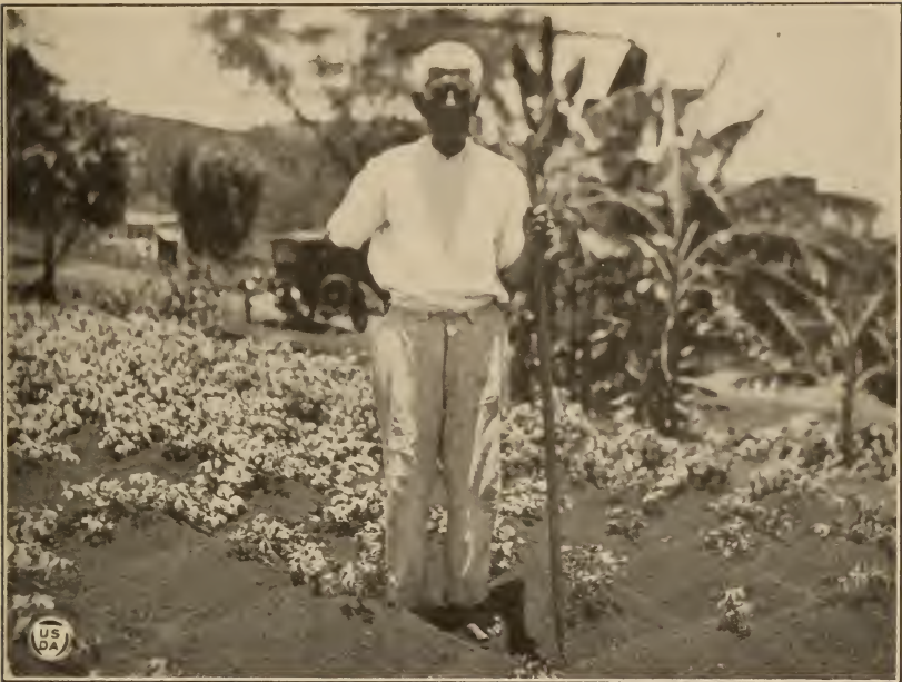
FIG. 1.—SWEET POTATOES GROWN BY MOUND OR HILL METHOD.