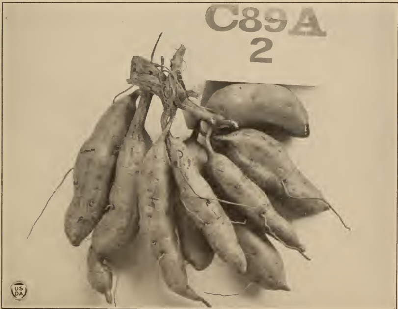
FIG. 2.—CLUSTER OF SWEET POTATOES OF UNIFORM SIZE AND SHAPE.