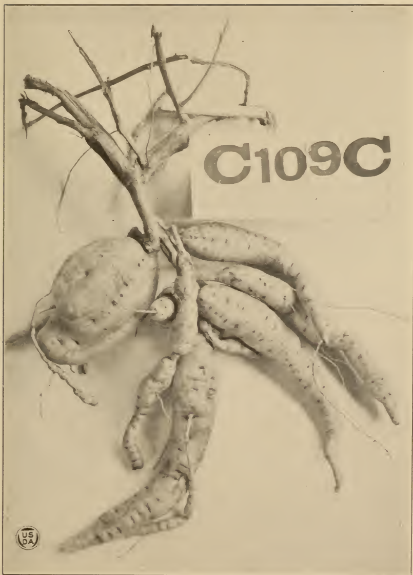
SWEET POTATOES PRODUCED IN HEAVY CLAY SOIL. IRREGULAR IN SHAPE AND UNMARKETABLE.