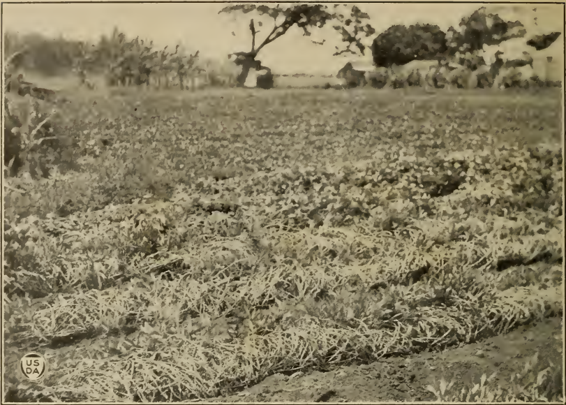
FIG. 1.—VINES TURNED TO ONE SIDE TO PROMOTE EVAPORATION FROM SOIL OF EXCESSIVE MOISTURE CAUSED BY STANDING WATER.