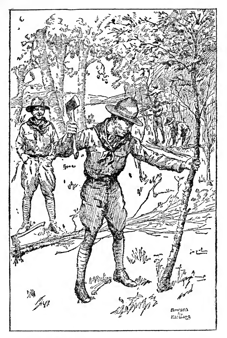
"EVERY TIME SKINNY HIT, HE HIT IN A DIFFERENT PLACE." Roy Blakeley Page 158