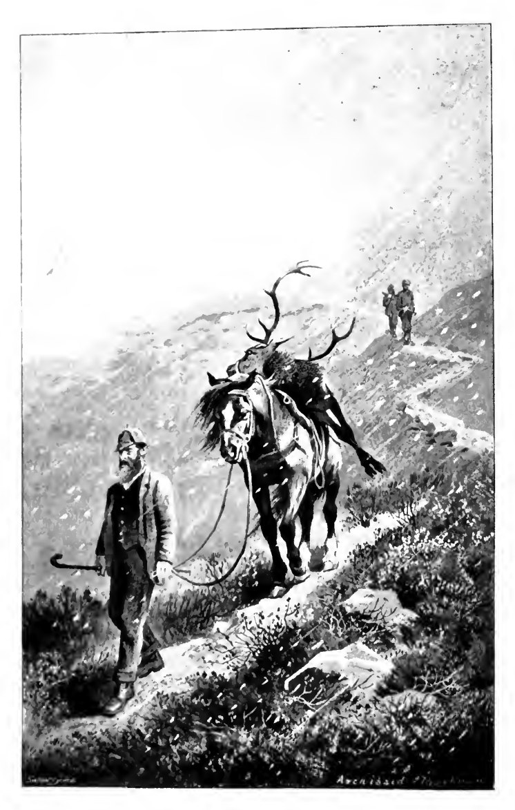
THE LAST STAG OF THE SEASON