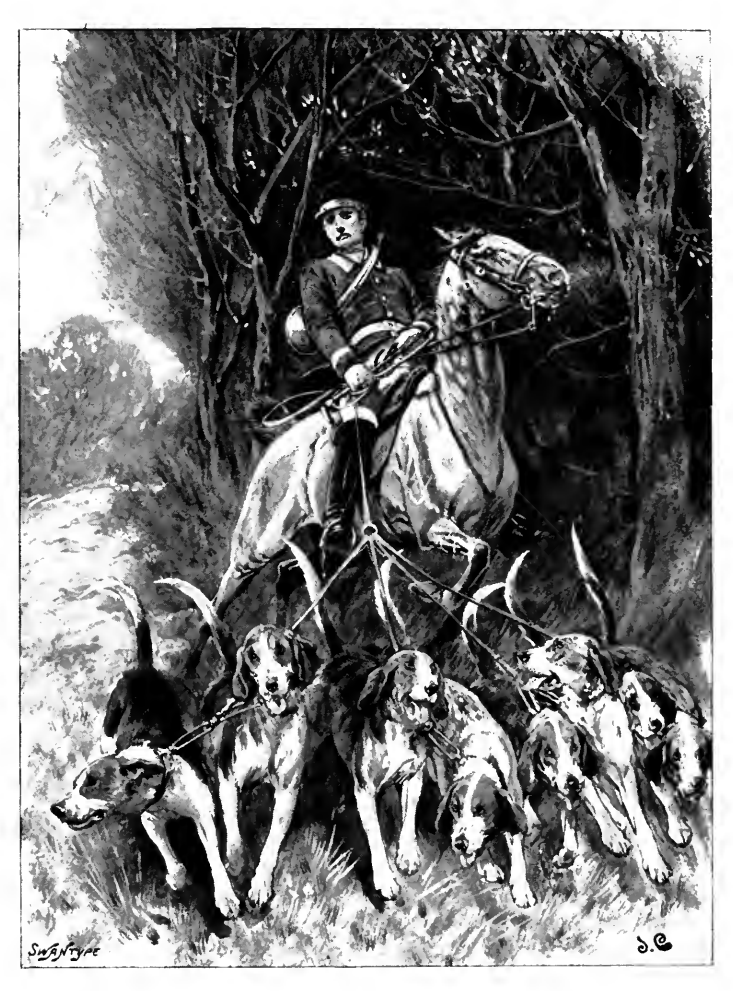
RATHER A HANDFUL