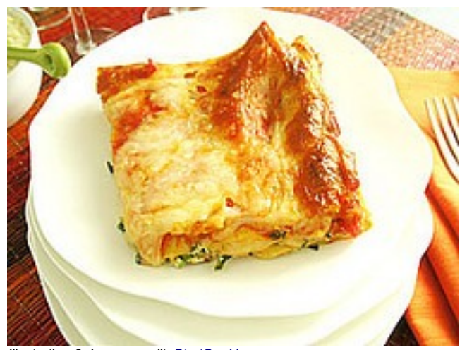
Illustration 3:

Along with basic pizzas and French bread, this is one food item I prefer to buy pre-made. When buying ingredients to make your own, it costs only fractionally less than buying a family sized fresh or frozen lasagne from the supermarket. Combined with the time and effort it takes to make... You do the maths!