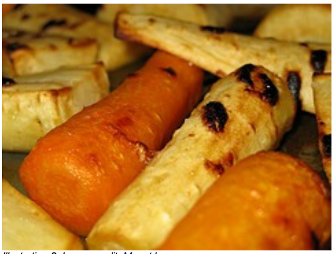
Illustration 2: