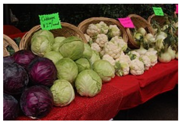
Illustration 1:

Broccoli and cauliflower: These are best steamed to preserve the flavour and texture, or can be eaten raw with dips or in salads. Try cauliflower cheese (also excellent with broccoli) or tempura cauliflower (see recipe below)