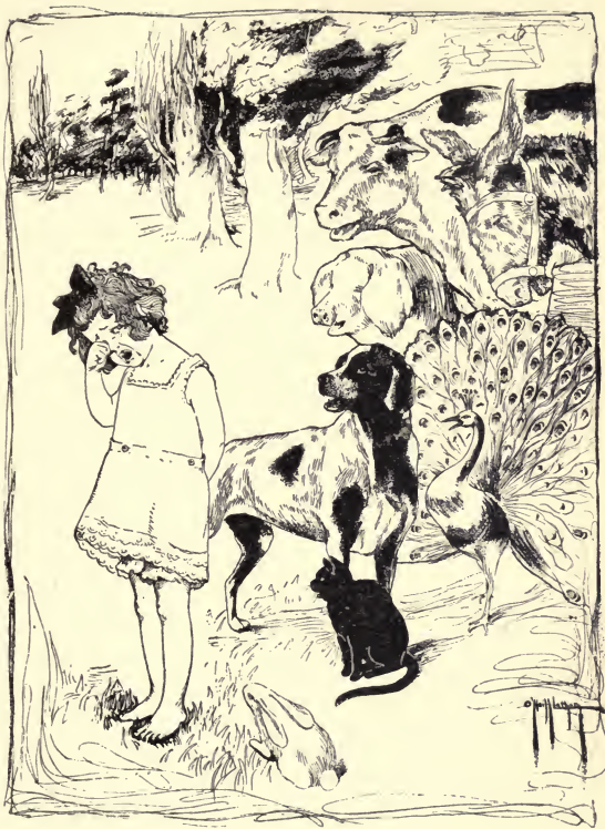
THE LAND OF THE CLUCKING OX.