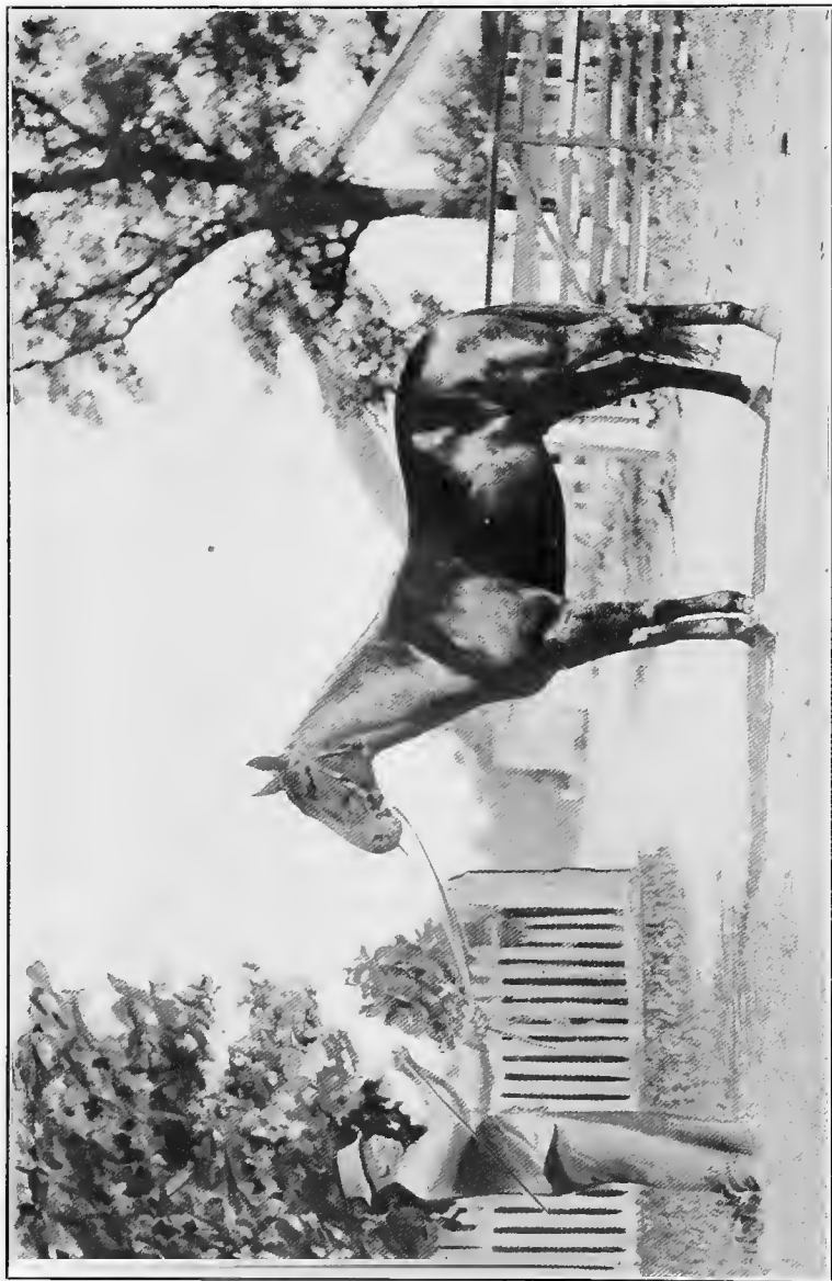
PETER VOLO. FOUR-YEAR-OLD. RECORD 2:02.