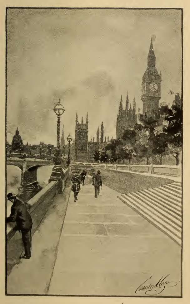
"The city of London at early dawn."—Page 211. Pleasures of Life.