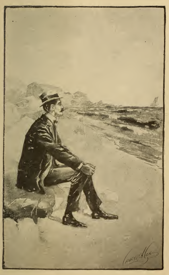
"The sea-shore, our grand and varied coast."--Page 143. Pleasures of Life.