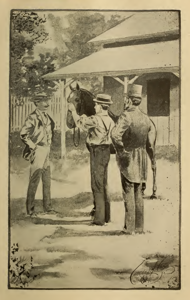
"In the choice of a horse we exercise care."—Page 64. Pleasures of Life.