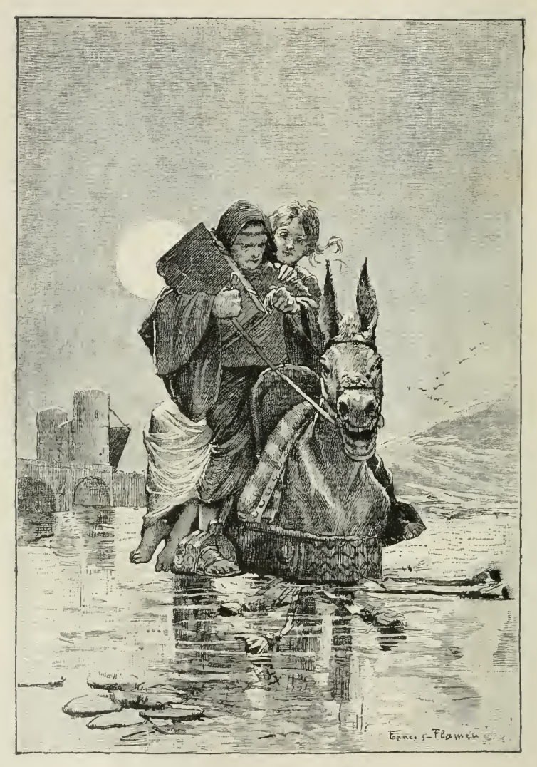
THE PASSAGE OF THE FORD.