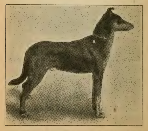
THE SMOOTH-CCATED COLLIE FERDINAND DE MONTFORT.

If the owner of the stud dog returns the bitch immediately after service, it is well to keep her confined another