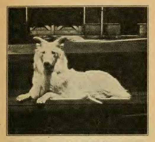
THE WHITE COLLIE JEFFERSON WHITE LASSIE,

as the shepherd may easily be mistaken for a wolf when he is seen from a distance. The chief qualities of the shepherd dog are his intelligence, alertness, loyalty, gentleness, courage, obedience, willingness and devotion. All of this will show in the animal's general appearance.