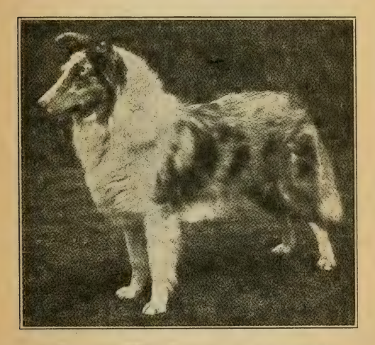
THE BLUE MERLE COLLIE, HANDSOME BLUE BOY.

course essential, but type drawn to extremes, that is, type and quality over physical and temperamental excellence are the two things that have done harm to many of our best breeds'.