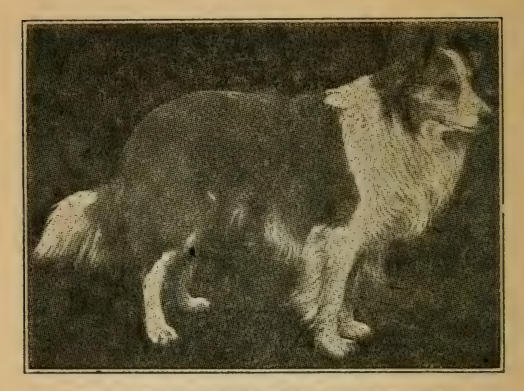
THE ROUGH-COATED COLLIE CH. METCHLEY WONDER, The Old Type Bench Show and Working Dog.

widespread that impressions made upon the mind of the mother during the period of gestation will influence the ultra uterine development of the young and cause birth marks, abnormalities or color changes. The theory no doubt arose in the Biblical story of Jacob and the sheep flocks of his father-in-law, Laban. Jacob was to receive sheep of certain colors as his own. In order to breed these colors Jacob set up colored rods in the field where the sheep grazed and thus the