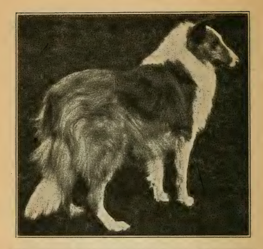
THE ROUGH-COATED COLLIE CH. EASTWOOD ENSIGN. A Modern Bench Show Collie.

the standard calling for 26 inches as the maximum; those over that height are considered too large. Females should run from 21\frac{1}{4} to 23\frac{1}{2} inches, with 24 inches as the maximum. Naturally, the fancier who is interested in utility alone, will not be so much concerned in drawing the question of size too closely, though