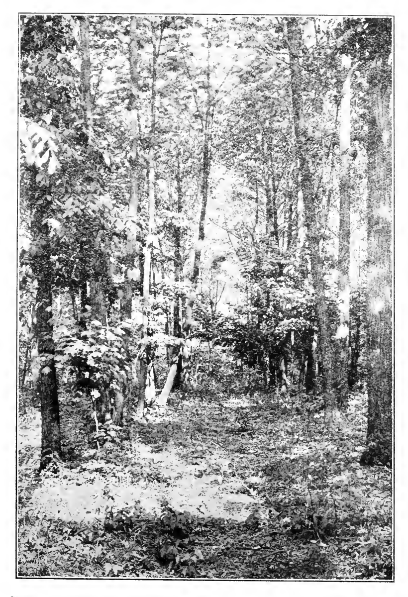
Chestnut plantation, thirty years old, Photo by U. S. Forest Service.