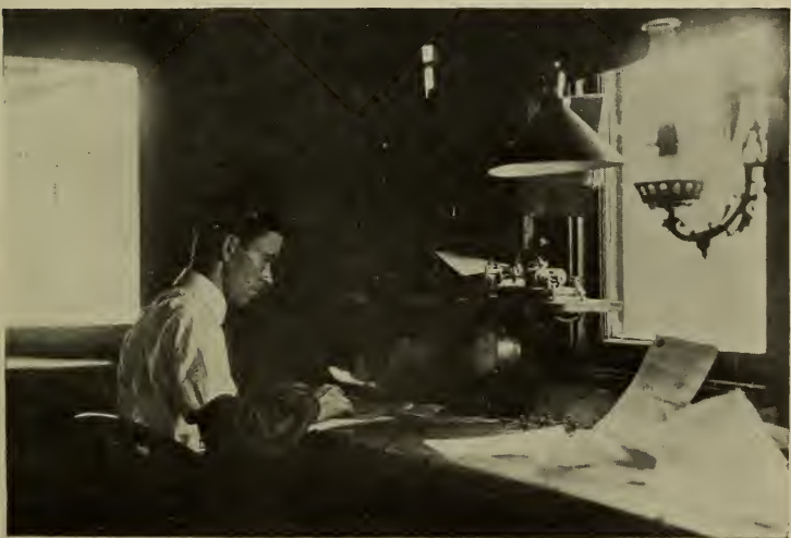
The station agent is a man of many responsibilities