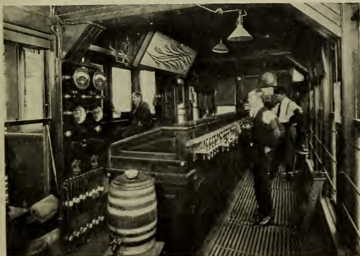
Inside the Terminal Tower where electricity does everything except the thinking