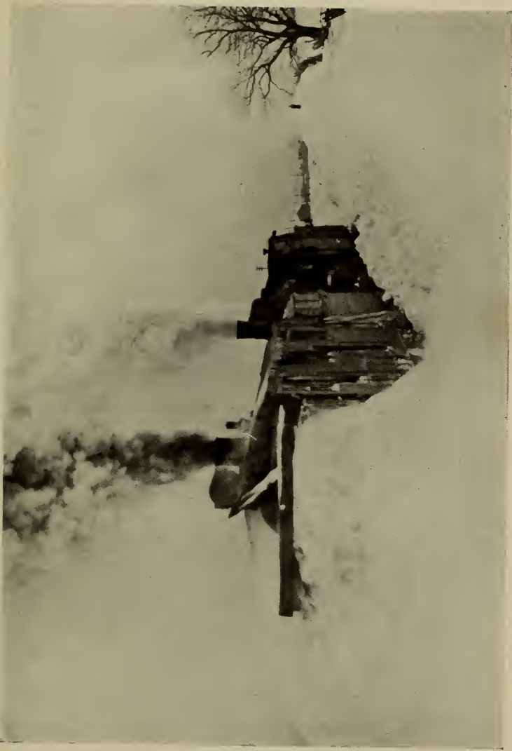
Bucking the drifts. A big snow plow forcing its way through drifts in an effort to keep the line open