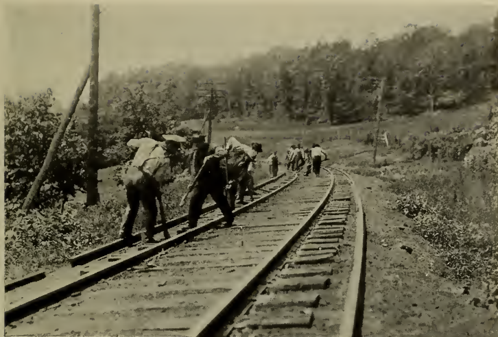
Changing rails between trains means hard work for the section gang