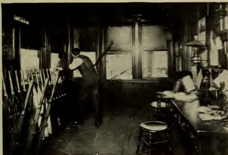
An old type of switch tower where switches and signals are turned by hand