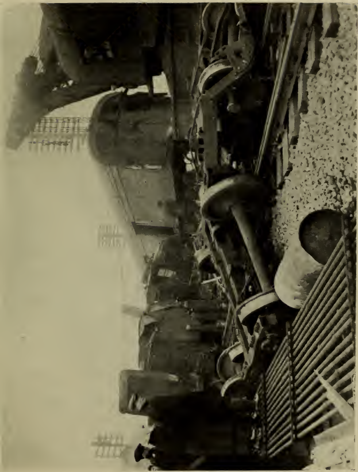
When the wrecking crew gets busy. The wrecking train has just arrived and the powerful derrick has begun to pick the wreck to pieces, lifting heavy cars bodily back upon the track