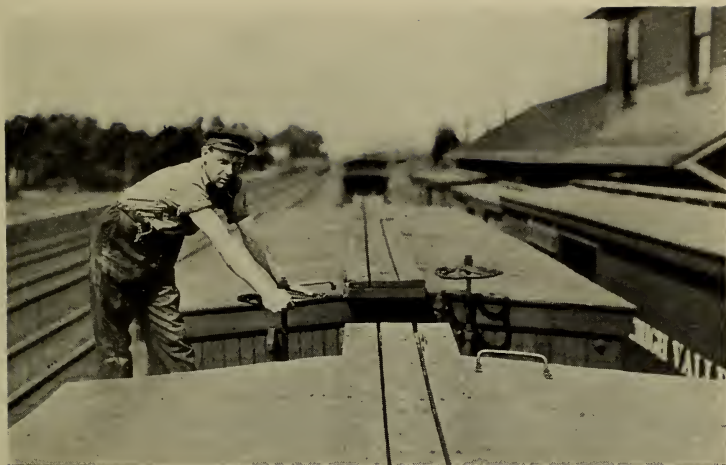
The man on top of the freight car can be president of the road some day