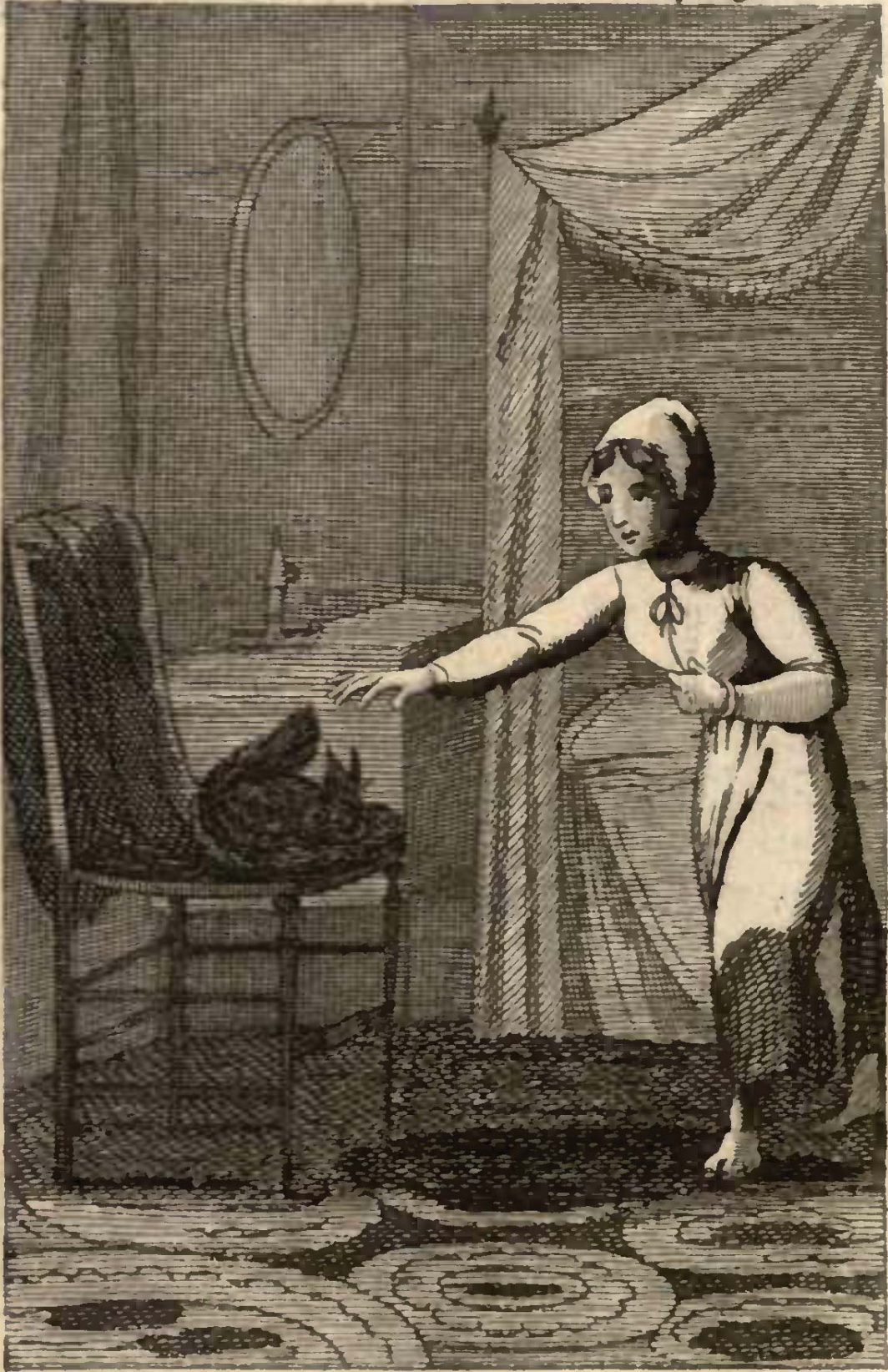
She distinguished me.