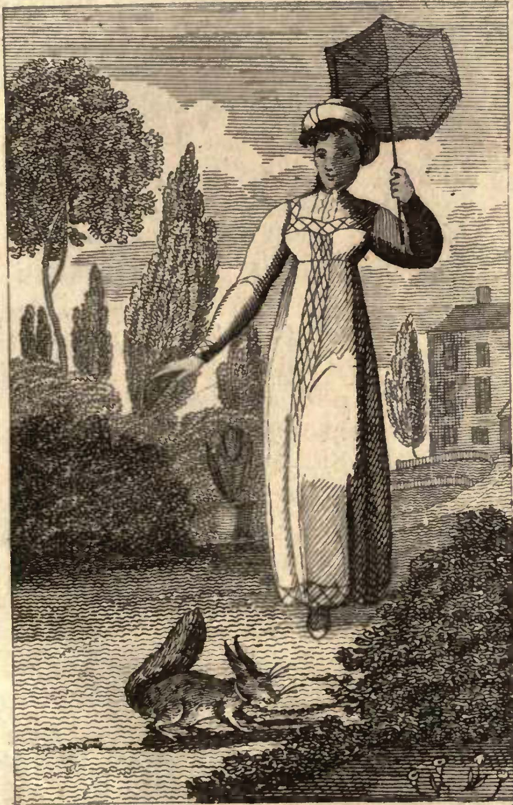
I made an effort to get loose.