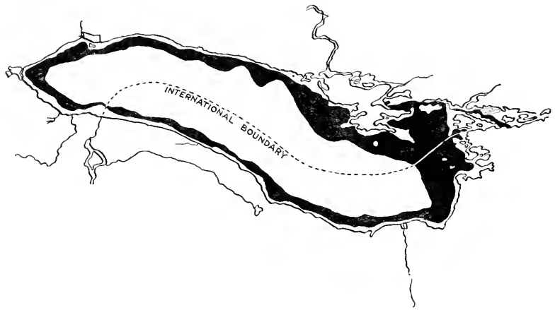
FIG. 5.-LAKE ONTARIO.

We are thus forced to the conclusion that the decrease in the whitefish supply can have no other cause than overcatching. This is not the place to discuss good and bad methods of fishing or remedies for the trouble. Our investigations point unmistakably to the cause of the depletion in the whitefish supply; it is the removal from the lakes of a larger number than can be replaced by natural processes and than has been successfully returned by artificial hatching.