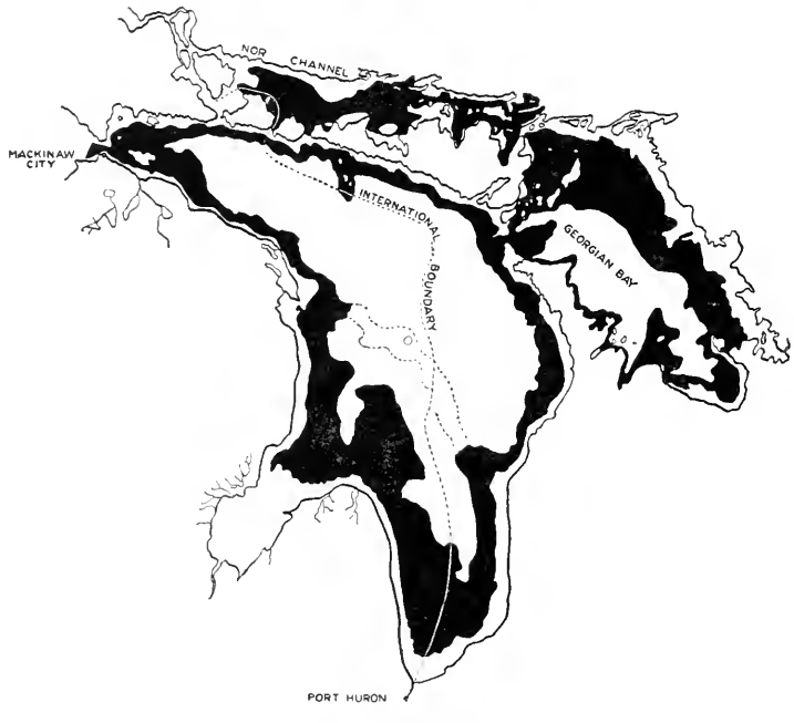
FIG. 3.-LAKE HURON.

In Lake Erie the whitefish area is divided into two portions—a western, which occupies the central portion of the lake west of Conneaut and is not interrupted by deeper middle water, and an eastern, which lies eastward of Conneaut and contains a small central middle portion of deeper water. The two portions are connected by a narrow neck at their southern borders. So far as I can learn the whitefish appear to confine themselves during most of the year to the eastern portion of this area, though for what reason is unknown.