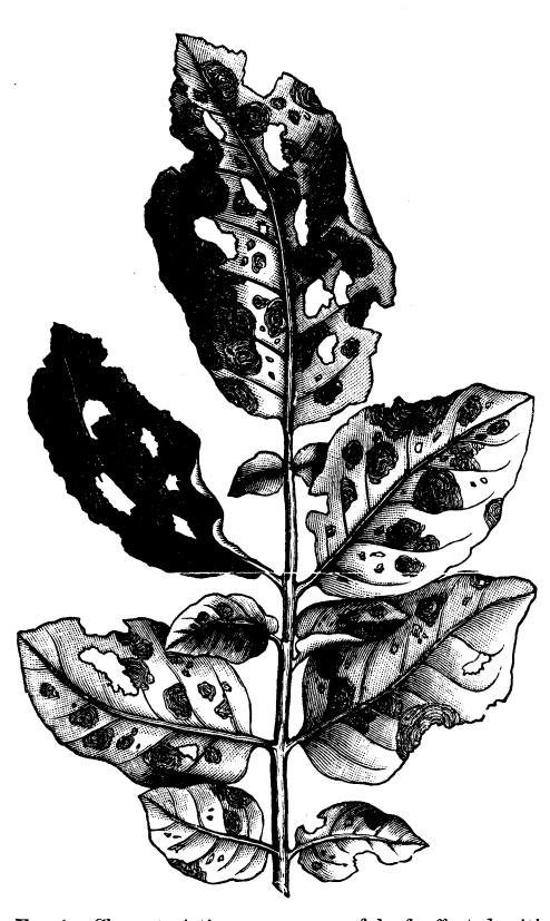
Fig. 1.—Characteristic appearance of leaf affected with early blight.

ing on small quantities of water at a time, the object being to obtain a smooth, creamy liquid, free from grit. When the lime is slacked add sufficient water to make 25 gallons. As soon as the bluestone is dissolved, which will require an hour or more, pour the lime milk and bluestone solutions together, using a separate barrel for the purpose and stirring constantly to effect a thorough mixing. It sometimes happens that sufficient lime is not added, and as a result the foliage may be injured. To be certain that the mixture is safe, hold a steel knife blade