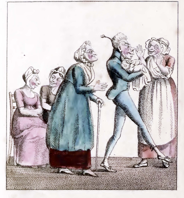
London Published May. 1807. by B. Tabart. 157. New Bond Street.