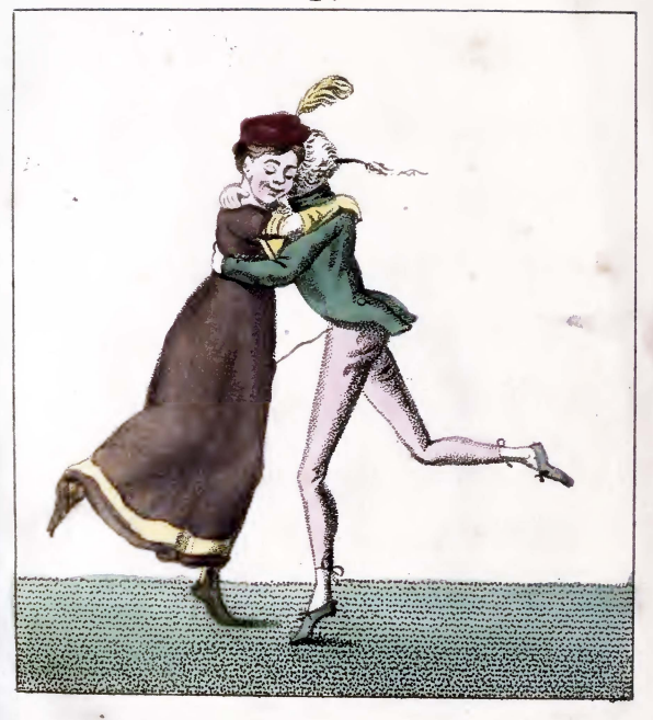
London Published May. 1007. by B. Tabart. 157. New Bond Street.