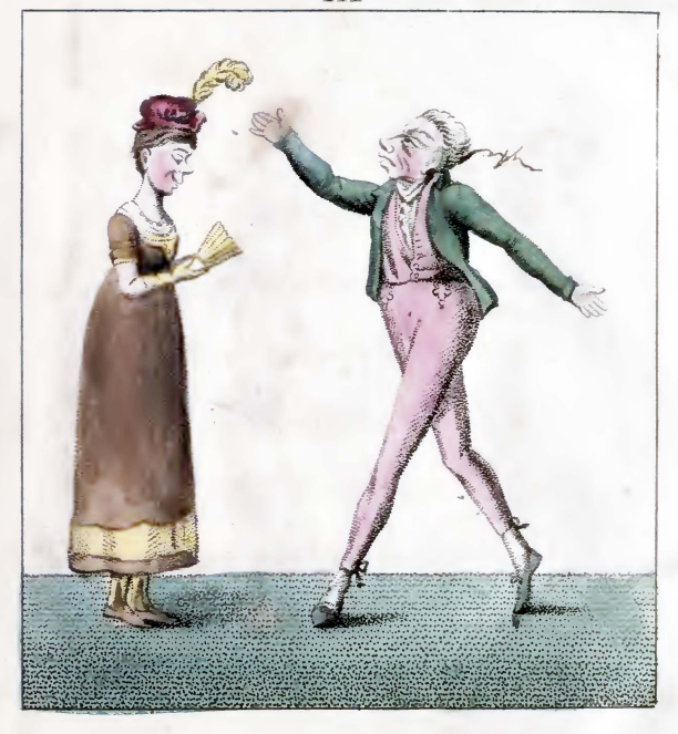
London Published May. 1807. by B. Tabert. 157 New Bond Street.