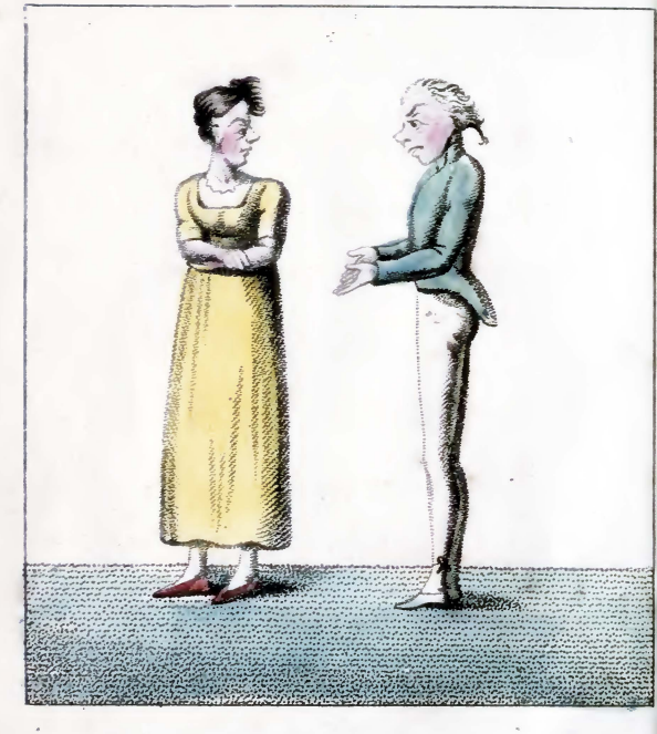
London Published May 1007. by B. Tabart 157. New Bond Street.