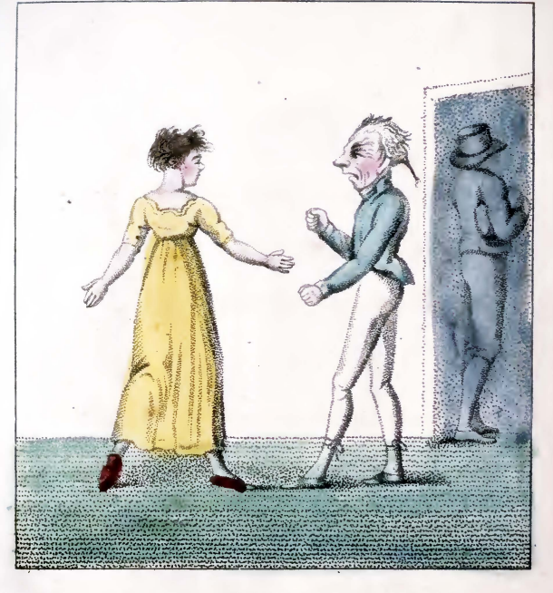
London Published May 1007. by B. Tabart 157. New Bond Street.