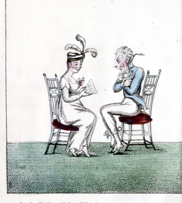
London Published May 1007. by B. Tabart. 157. New Bond Street.