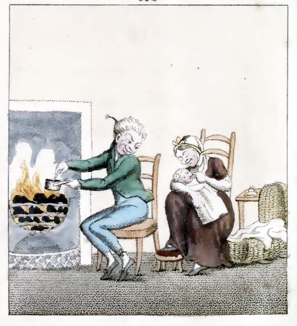
London Published May. 1807. by B. Tabart 157New Bond Street.