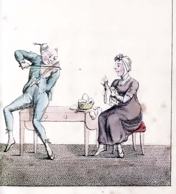
London Rublished May. 1007, by B. Tabart. 157. New Bond Street.