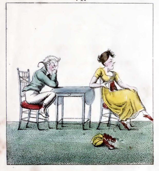
London Published May. 1007. by B. Tabart. 157 New Bond Street.