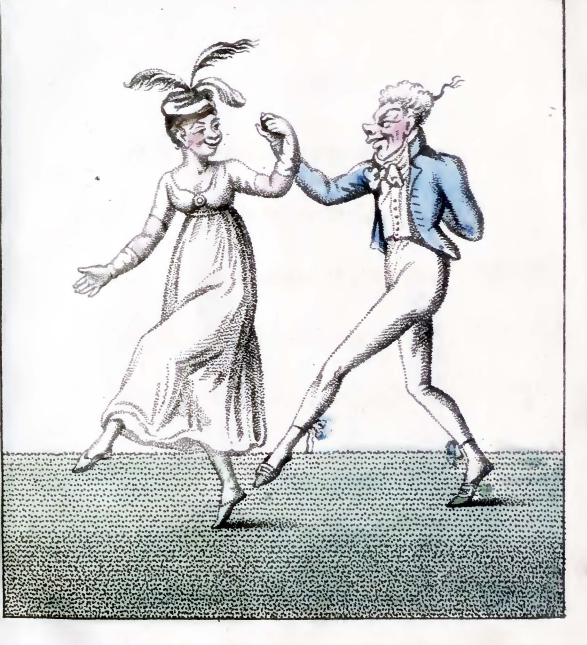
London Published May 1807. by B. Tabart 157 New Bond Street.