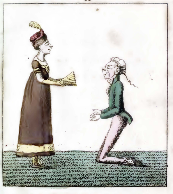
London Rublished May 10 07. by B. Tabart 157. New Bond Street