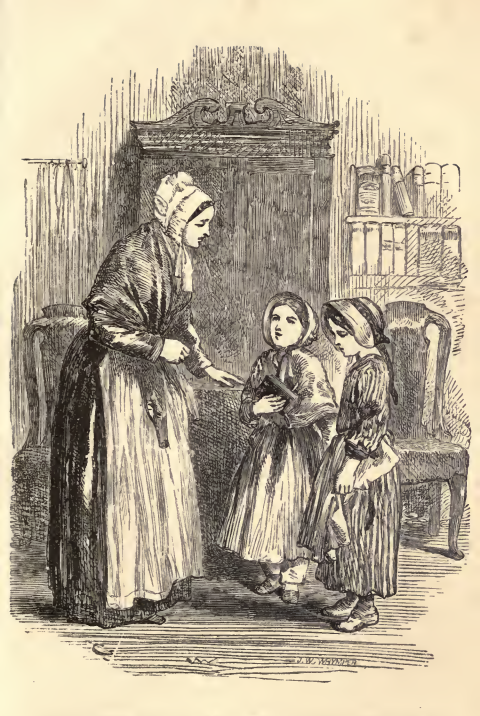
"Te!l mother what you want," said the child, encouragingly. "Mother, she never heard about Jesus!""—P. 224.