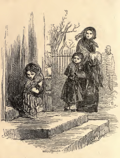
""Mamma! did you see that little girl on those brown steps?"" P. 53,