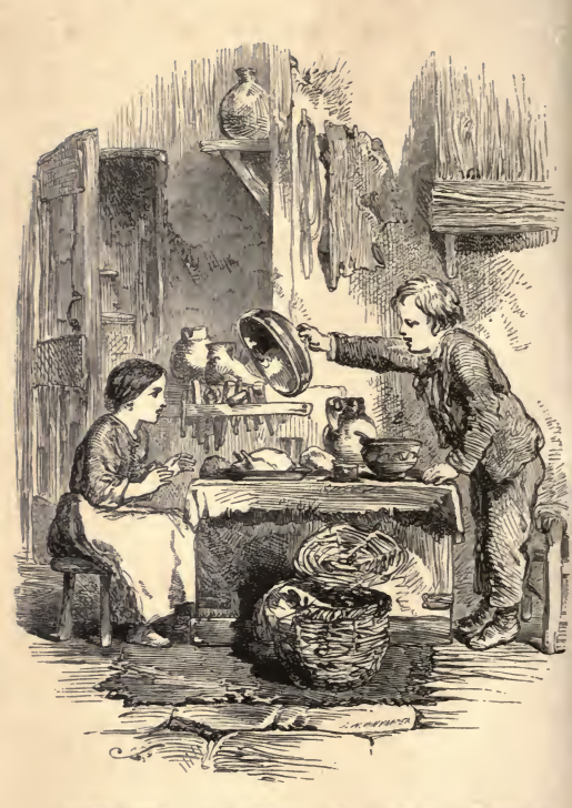
"'A roast chicken!—Oh, Rosewald!—How mother will like a piece of that! How good it smells!'"—P. 161.