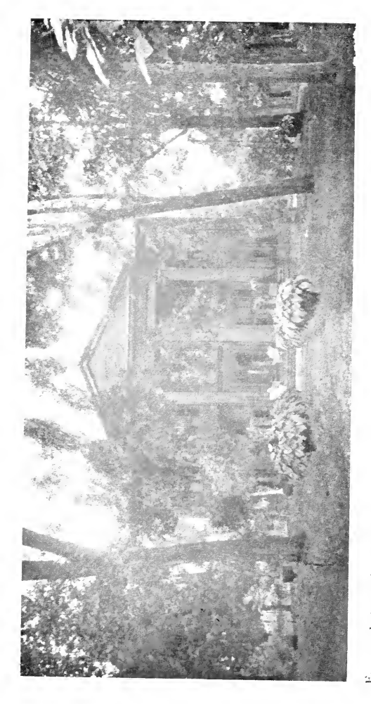
From a photograph.