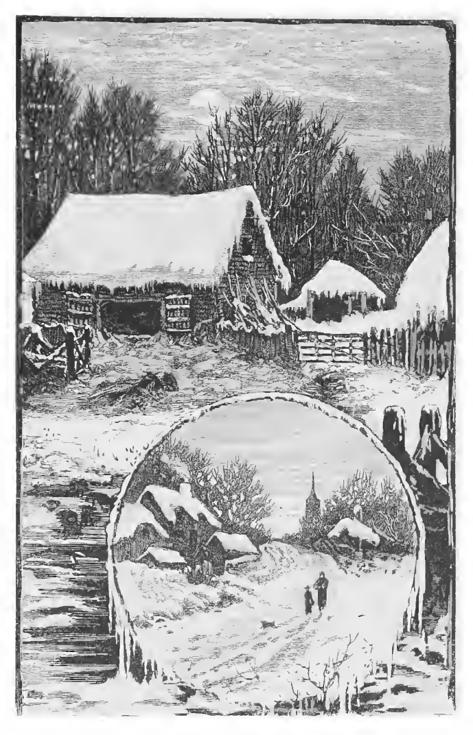
He declared the weather was made on purpose for skating. P. 140.