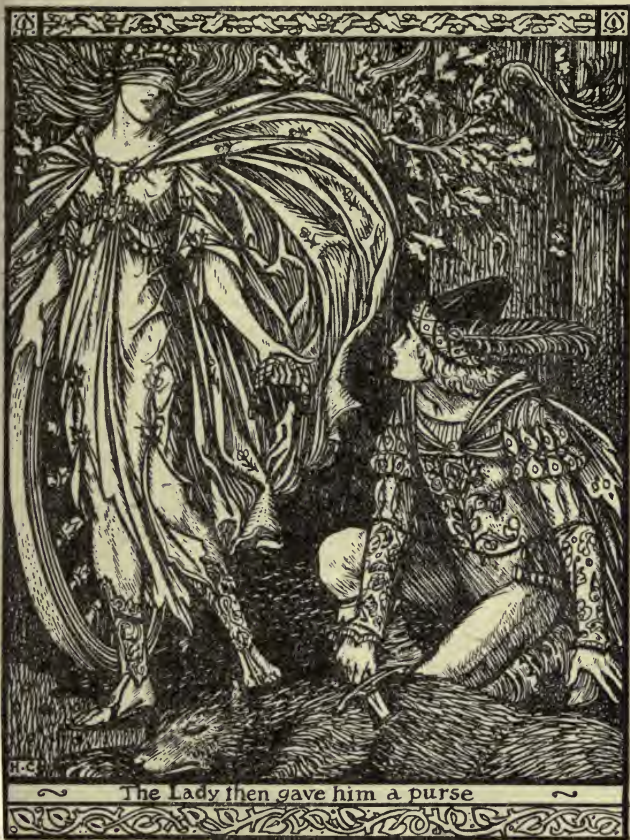
The Lady then gave him a purse