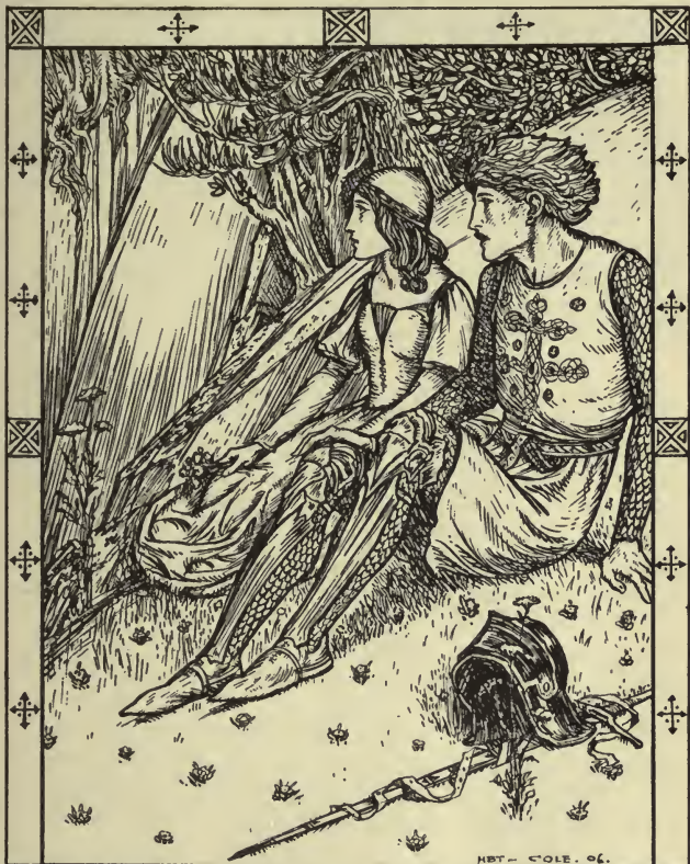
Melilot and Sir Crucifer