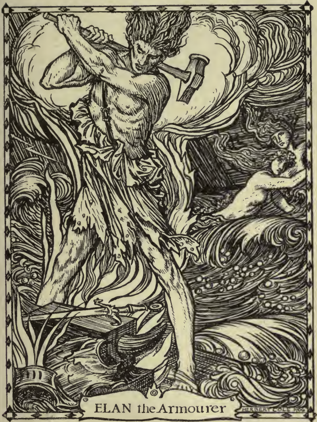
ELAN the Armourer