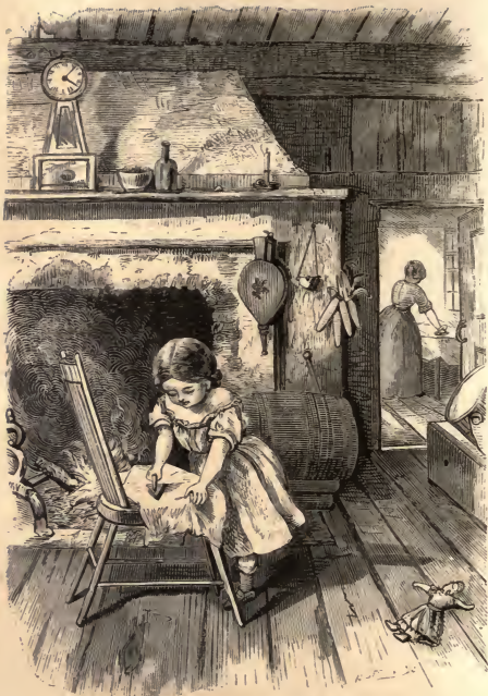
PRUDY'S IRONING. — Page 147.