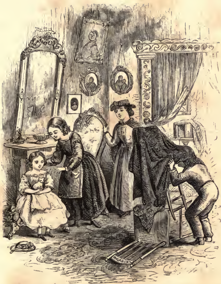
PRUDY SITS FOR A PICTURE. — Page 132.