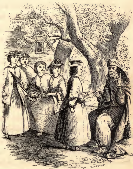
FORTUNE TELLING. — Page 90.