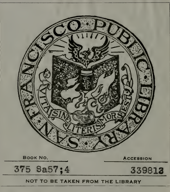
Form No. 37 5M-4 31