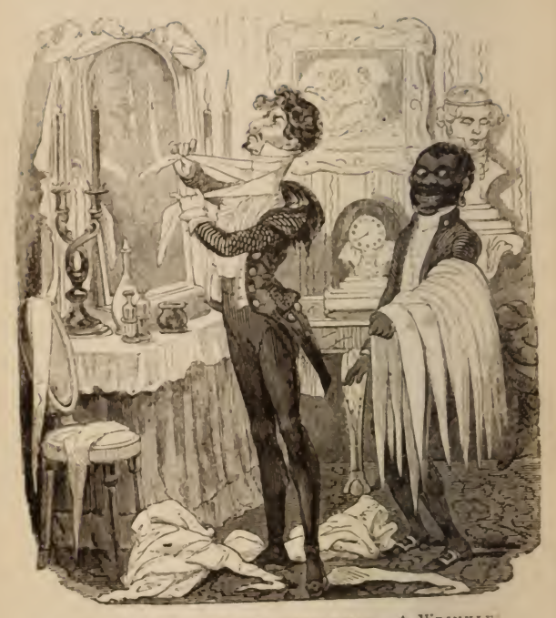
THE DANDIFIED YOUNG GENTLEMAN,-A WRINKLE.