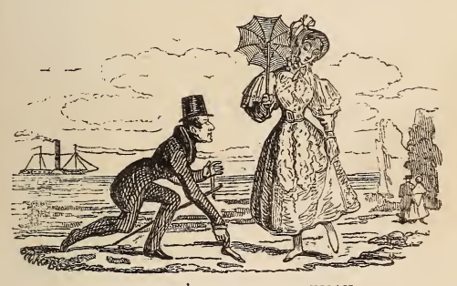
THE LADIES' YOUNG GENT LEMAN.