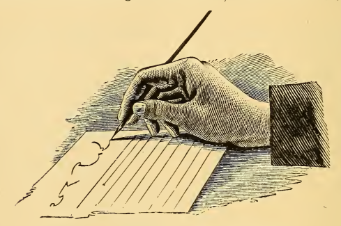
PROPER POSITION OF HAND AND PEN.

freely. The pen or pencil should be lightly grasped between the first and second fingers and thumb, as shown in the cut.