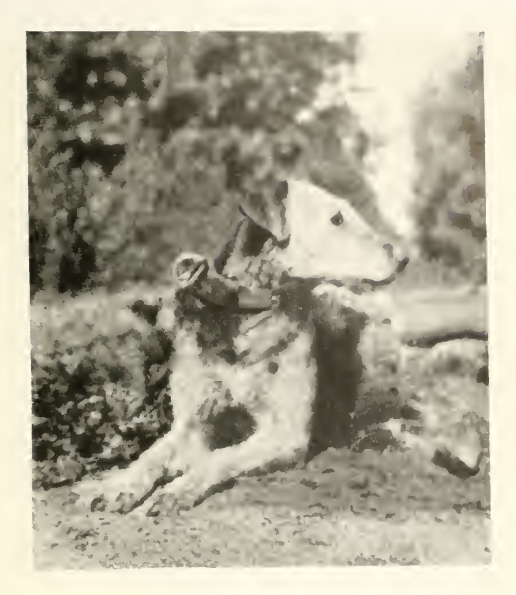
Sentry dog on duty.