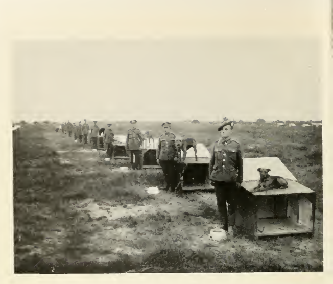
Type of kennel used.