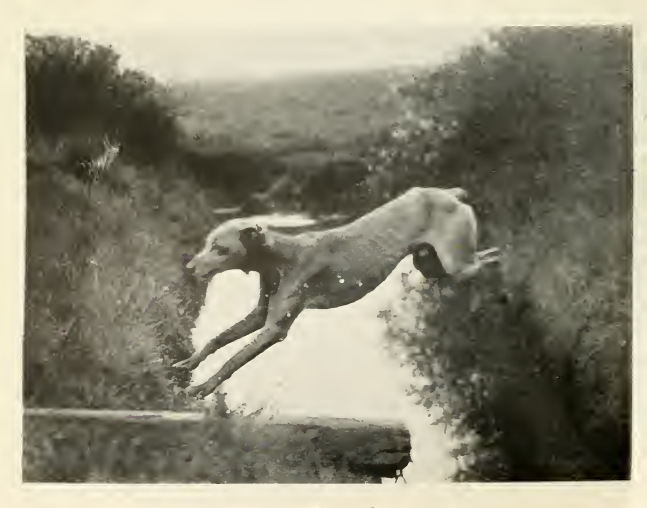
Training the messenger dog to water