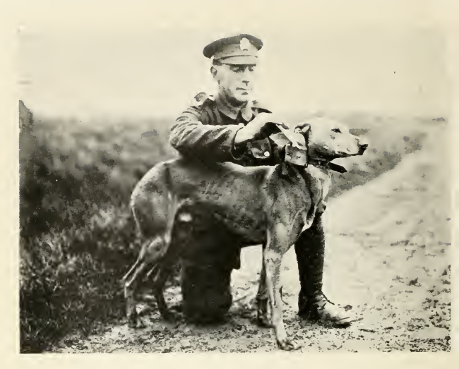
Messenger dog. Putting the message in the dog's collar.