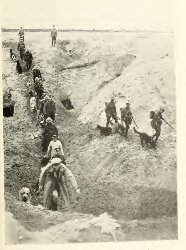
Part of the training ground at the War Dog Schools