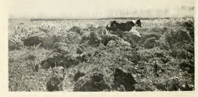
Messenger dog on Western Front going over shell holes,