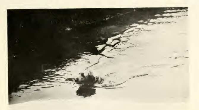
Messenger dog bringing a message across a canal on the Western Front.