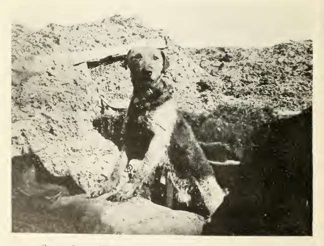
Sentry dog on Western Front, sent to Belgian Army in 1914.