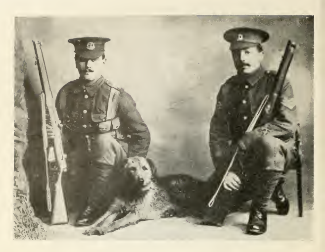
Sentry dog This dog went out with the Expeditionary Force in 1914, and was killed on the Aisne