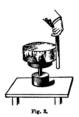
as the icing begins to stiffen, arranging them in wreaths and sprays, &c., as you please. Ordinary cakes are iced directly on to the cake, but in many instances a layer of almond icing is placed on the cake, the latter being then iced as above, when this first almond icing is firm. (The recipe for this has been given.) When this paste is made (it should be fairly firm), roll it out with the rolling pin to the size and shape of the cake, lay it on the cake (which should have been trimmed to make it flat and smooth), and again roll it with the rolling pin to level it nicely. If you put almond icing round the sides, roll these

covered (as in Fig. 3), finishing it by passing the knife carefully round it with an even, circular sweep (never lifting the knife till the whole circle is made, or it will leave a ridge), to secure a nice smooth surface. The knife must not be laid flat on the cake, but held slantingly, the back of the knife against the cake, and the blade at an angle of 45°, so as to carry off the surplus sugar with the sweep of the knife as you finish the circle. Let it stand till firm, in a dry place, if to be left as it is; but if to be ornamented with bonbons, glacé fruits, &c., put these on