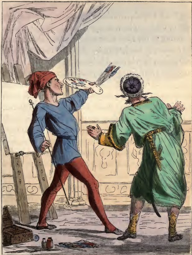
Owlglass shows his Picture to the Count.