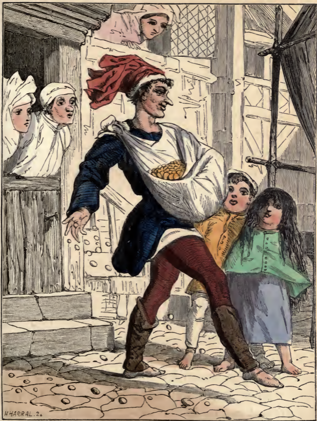
Owlglass sowing Rogues.