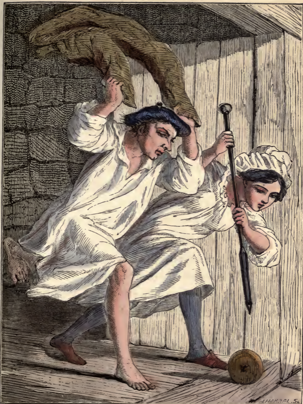
The Bannock Hunt.