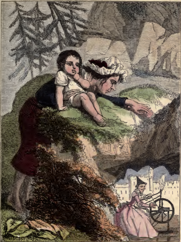
The good Woman discovering the Fairy.