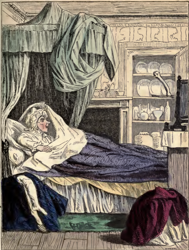
The Teeny-tiny Woman's Fright.