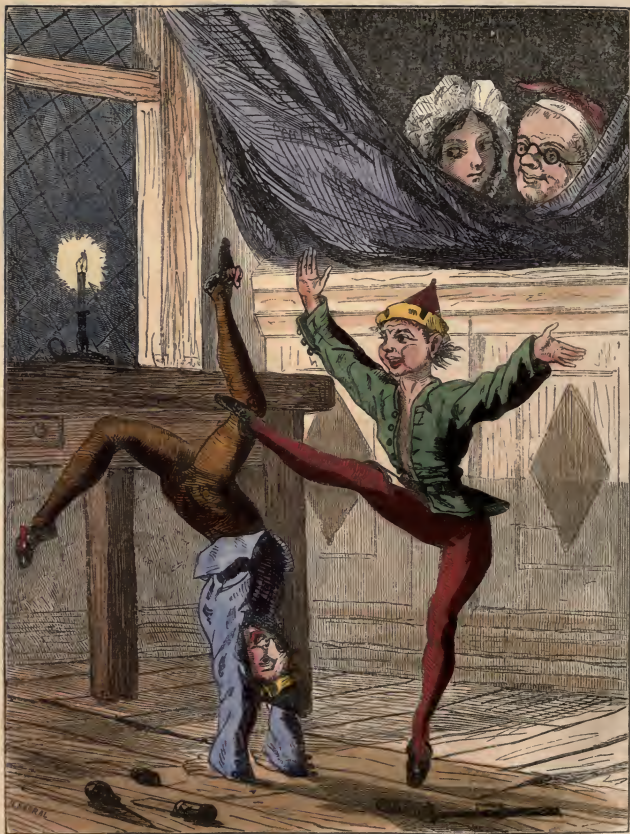
The Dwarfs' Capers.