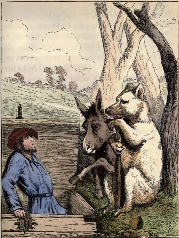
Friends in Grave Consultation.