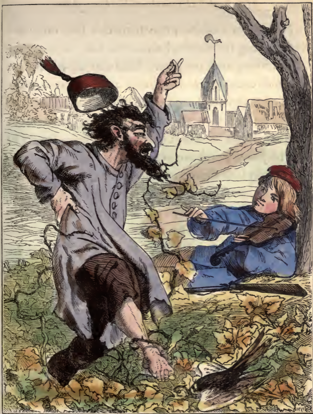
The Jew's Dance.