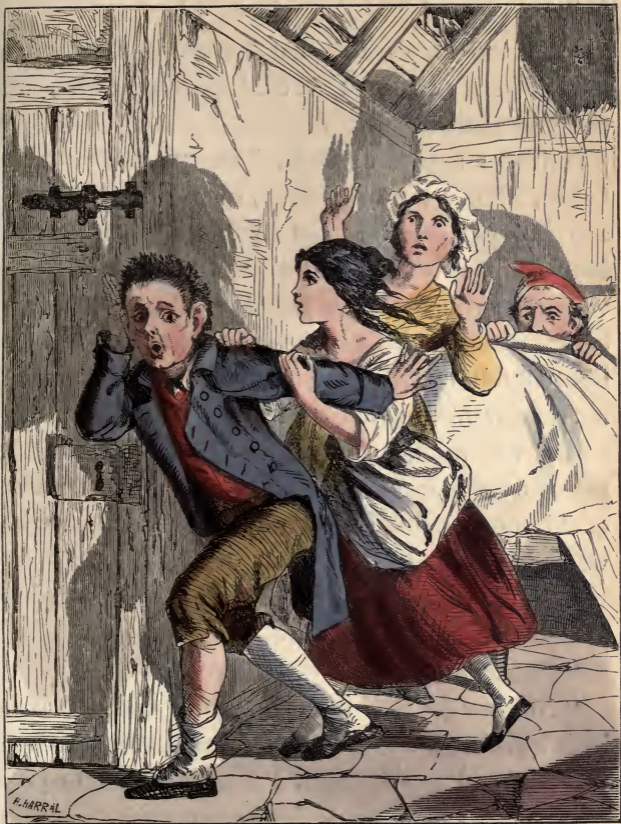
A Terror-stricken Household.