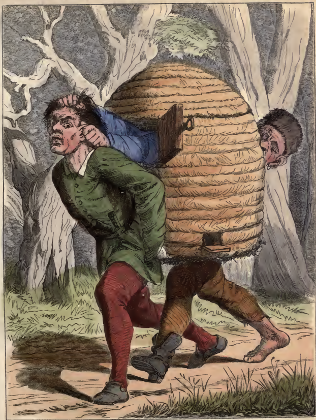
Owlglass in the Beehive.