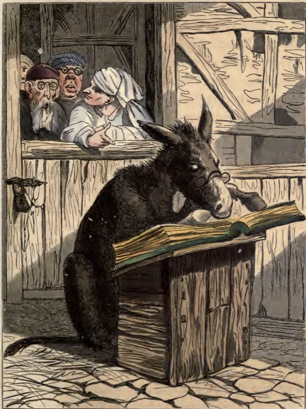
Owlglass's learned Donkey.