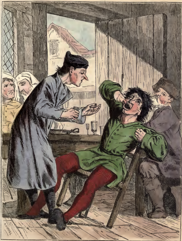
Owlglass administers a Pill.