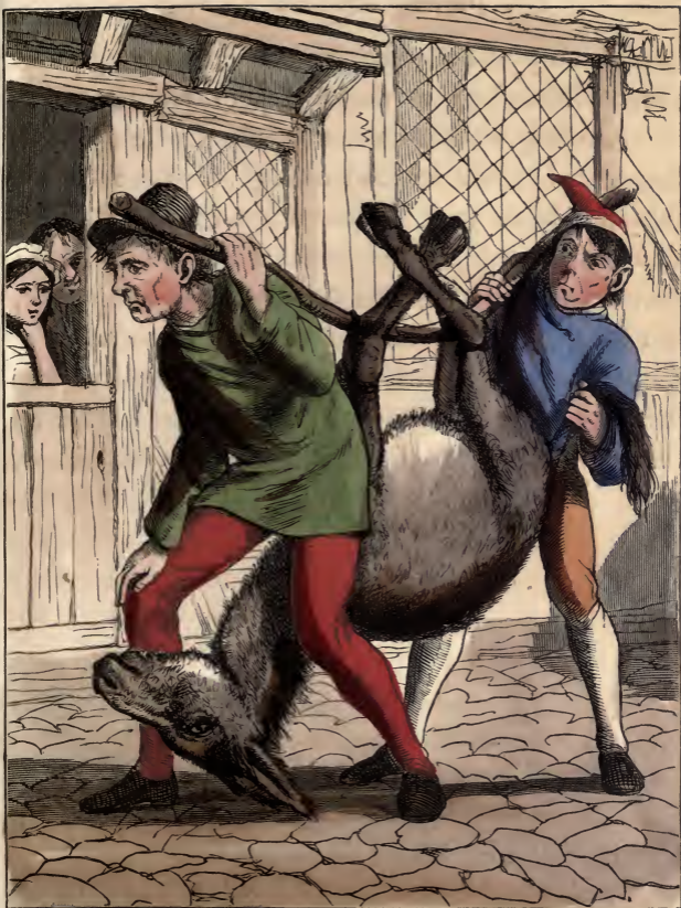
The Beast a Burden.