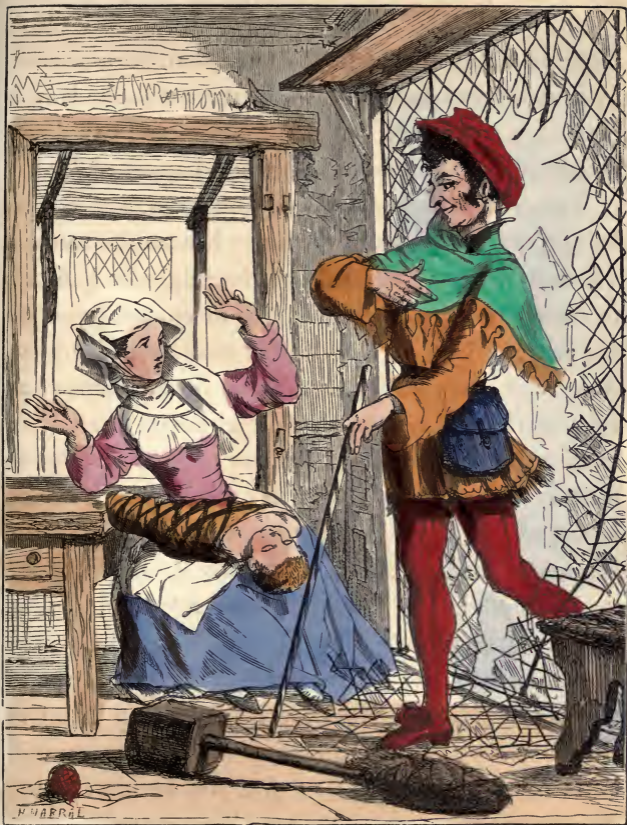
Owlglass walks through the Barber's Window.