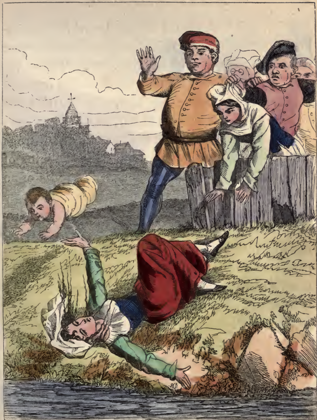
Owlglass's Second Baptism.