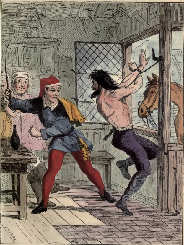
The Jew's Bargain.