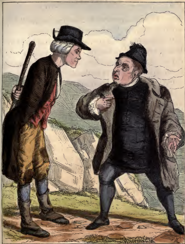
The Bishop and the Highwayman.