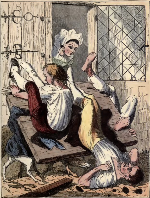
Downfall of the Tailors.