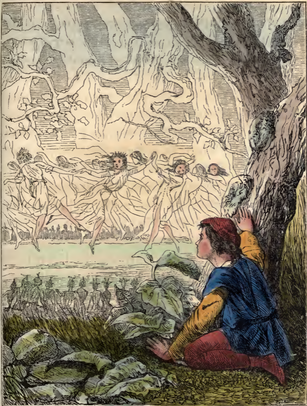
The Sight Jackey saw.