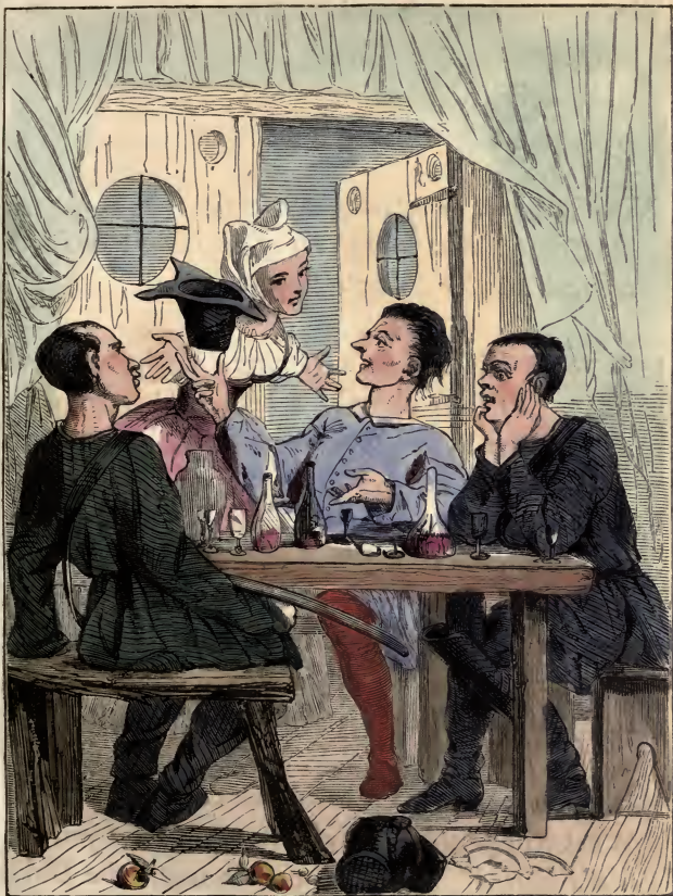
Owlglass paying the Landlady