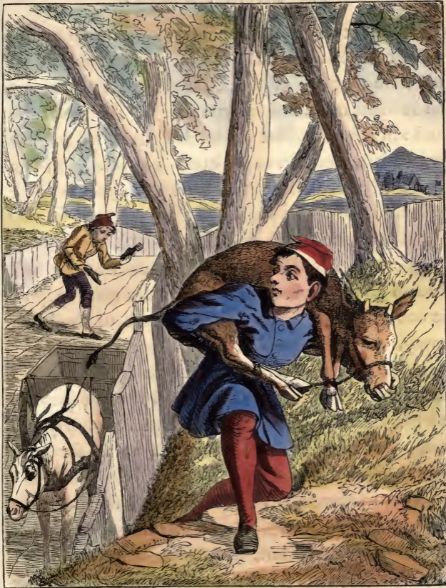
The Cobbler carrying off the Calf.