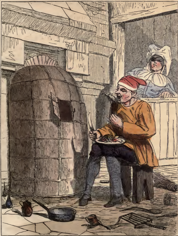
Owlglass eats the Priest's Fowl.