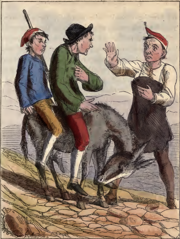
The Burdened Beast.