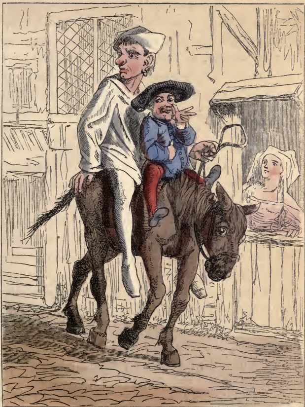
Young Owlglass mocking the Villagers.