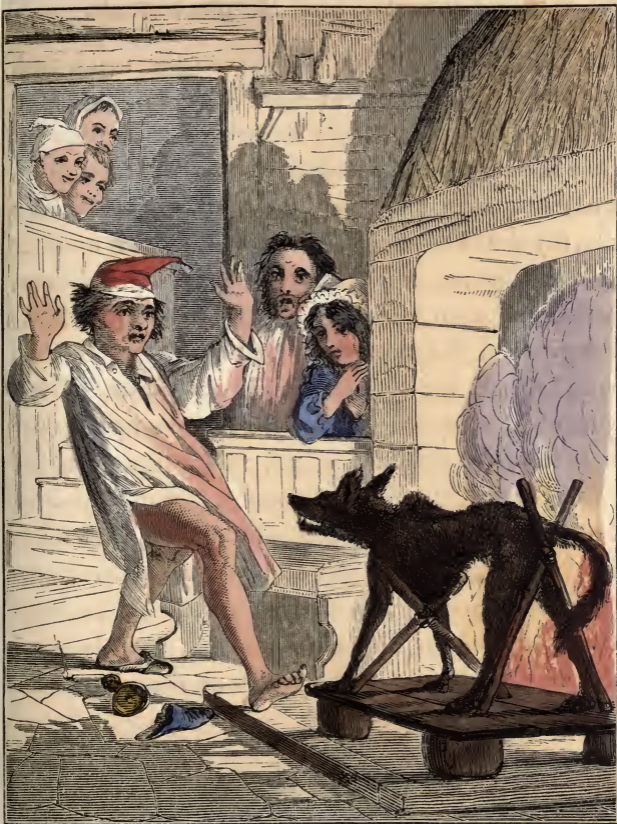
The Frightful Monster.