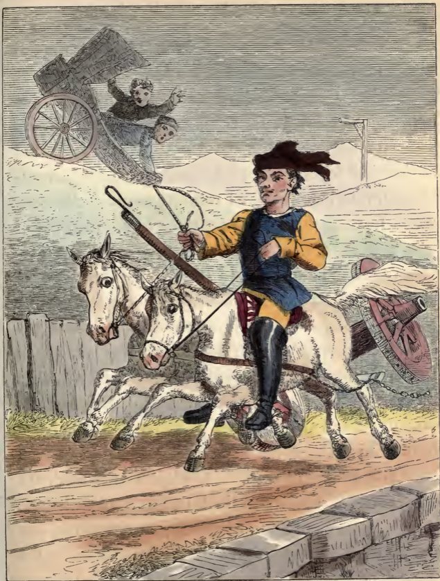
Owlglass's "skilful" Coachmanship.