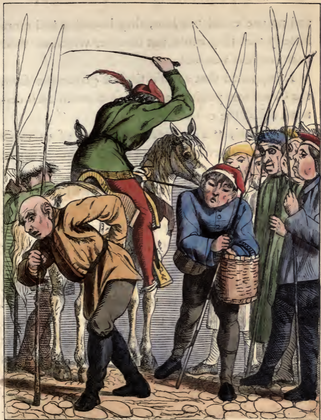
The Lost Fisherman found.