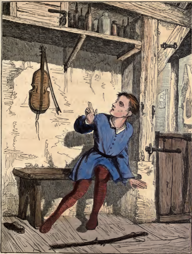
The neglected Fiddle repining.