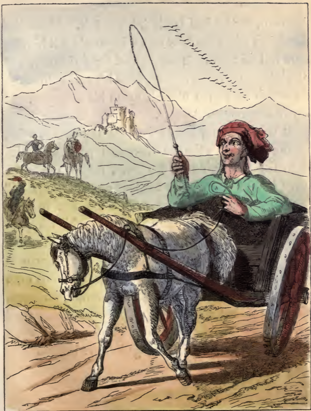
Owlglass Rides on his own Land.