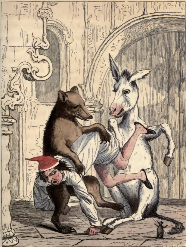
The Merchant's Rough Handling.