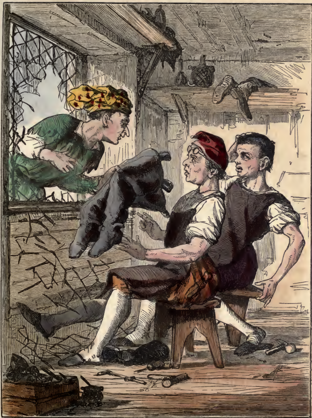
Owlglass returns with the Boots.