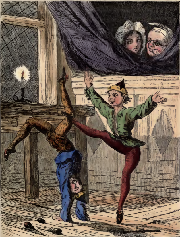
The Dwarfs' Capers.