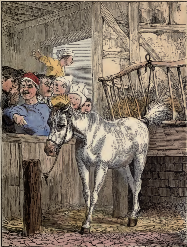
The Horse's Tail where his Head should be.