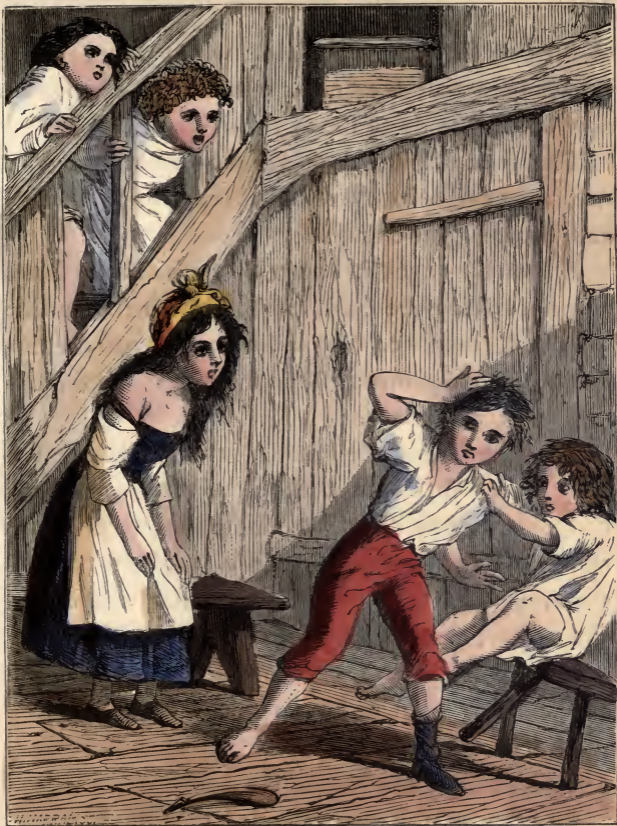
The Brownie's revengeful Pranks.