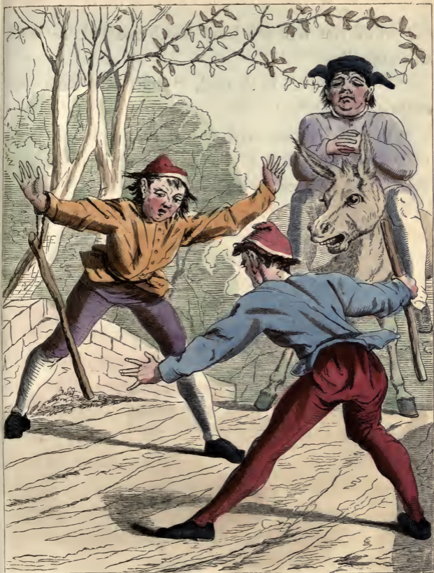
The Three Wise Gothamites.