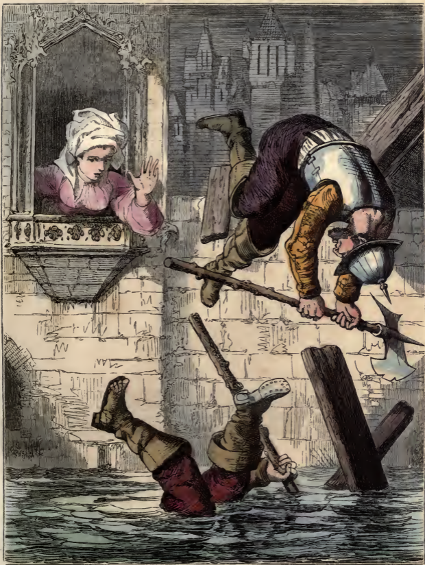
The Watchmen of Nurenberg.