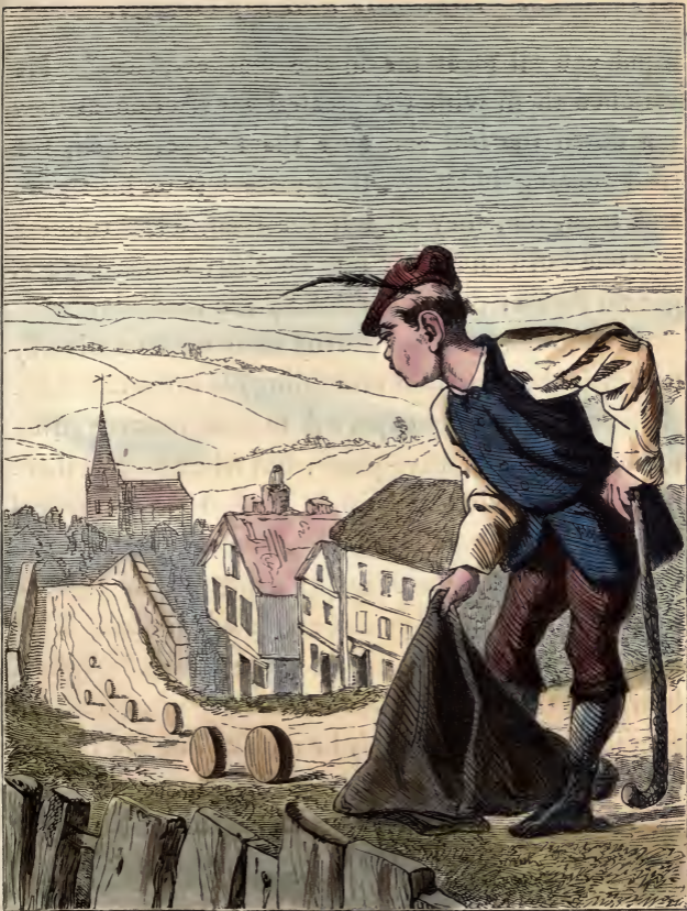
The Gothamite and his Cheeses.