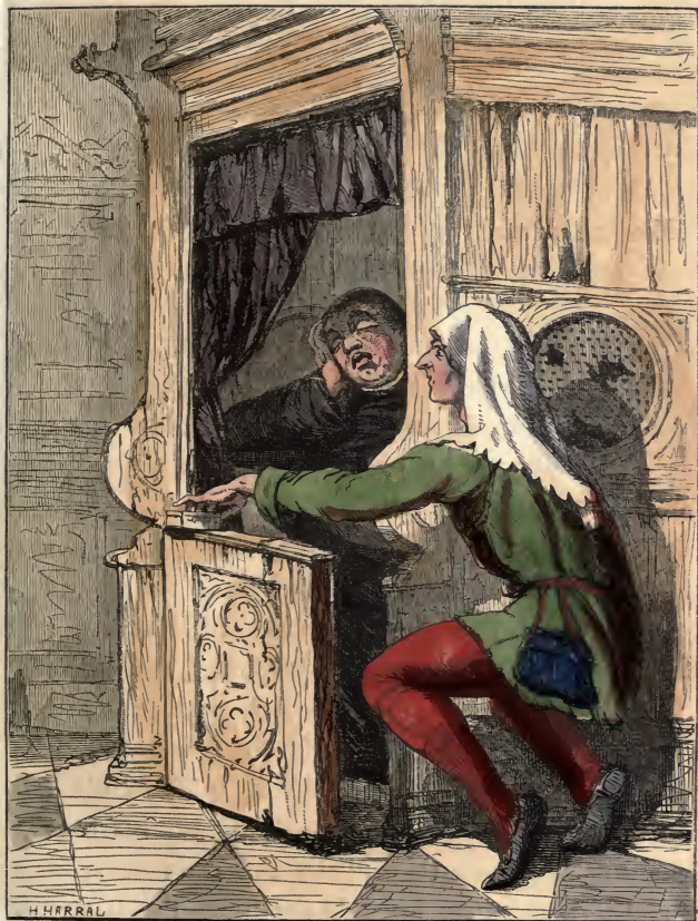
Owlglass takes the Priest's Snuff-box.