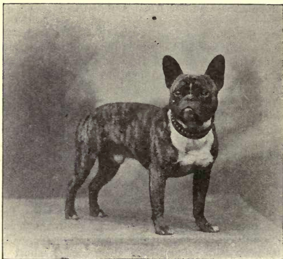
FRENCH TOY BULLDOG.

DESCRIPTION AND POINTS OF THE FRENCH TOY BULLDOG.— General Appearance. —The French bulldog ought to have the appearance of an active, intelligent, and