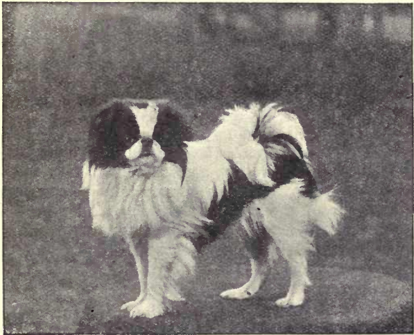
TYPICAL JAPANESE SPANIEL.

Distemper. —As a matter of actual fact, there is no such disease as distemper. There are two diseases, or two groups of diseases, both more or less contagious, which, for want of skilled diagnosis, are indifferently so named, but their popular designation is so firmly rooted that “distemper” will be with us to the end of the chapter, and so long as the disease is properly treated it matters little whether we call it bronchial catarrh, gastro-enteritis, typhoid, or distemper. Per-