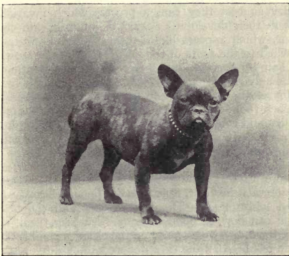
FRENCH TOY BULLDOG.

The puppies are born singly, and if a bitch has a