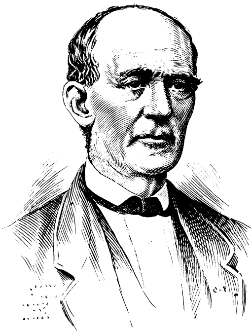
WILLIAM H. McGUFFEY