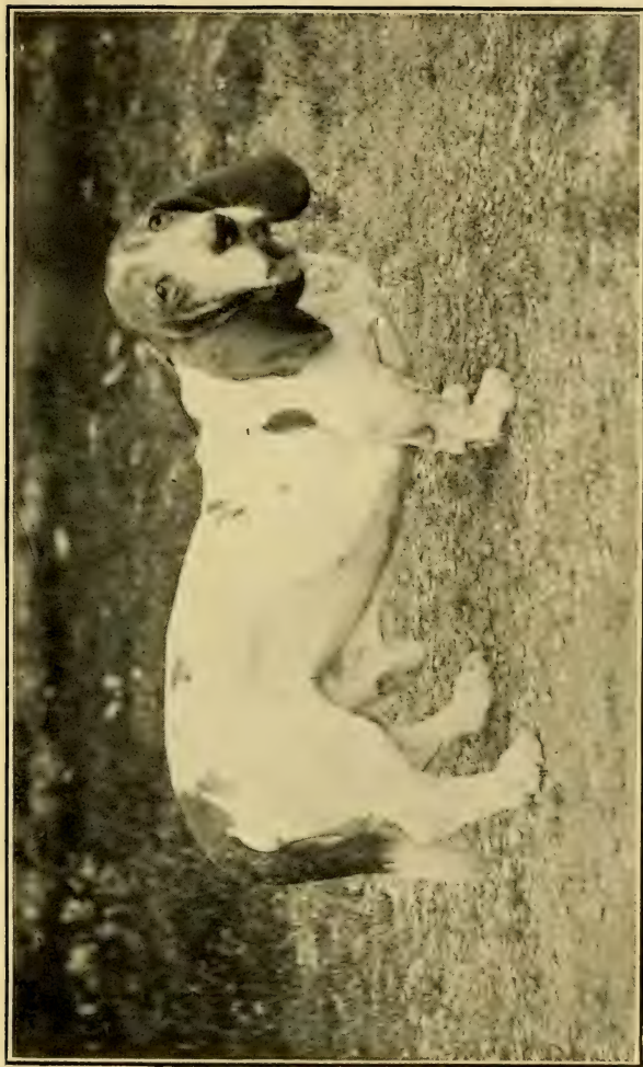
BASSETT HOUND DOG.