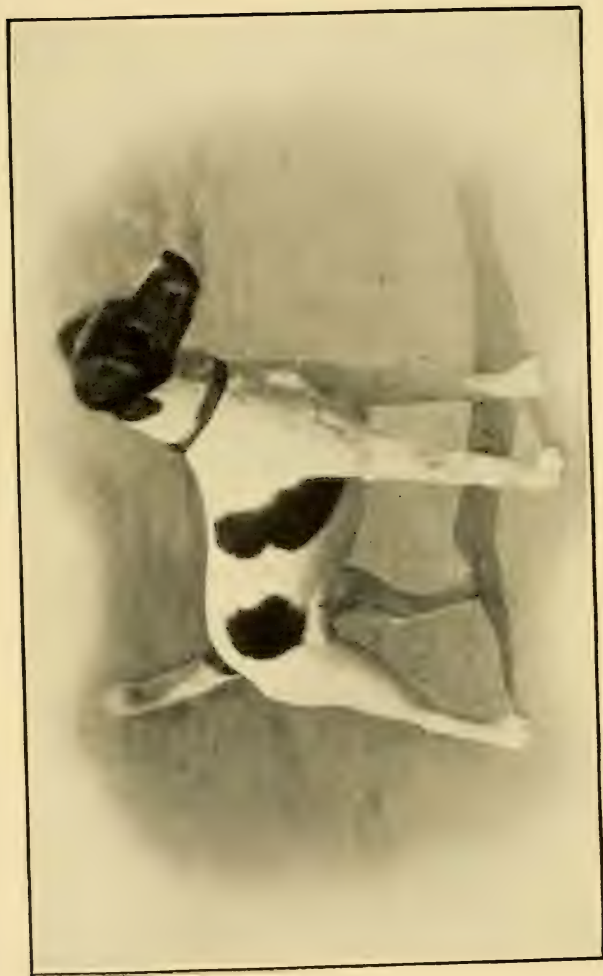
FOX TERRIER DOG.