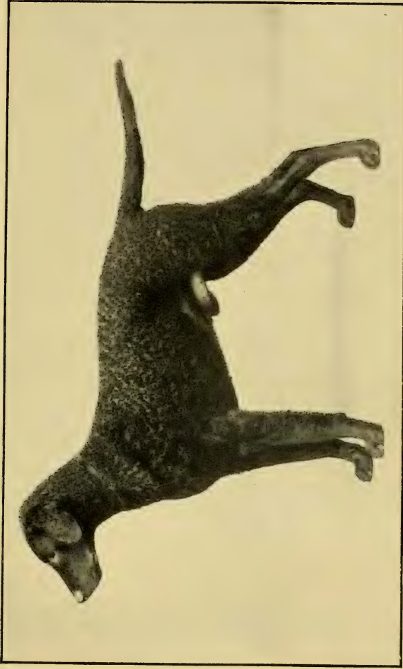
CURLY COATED RETRIEVER DOG.