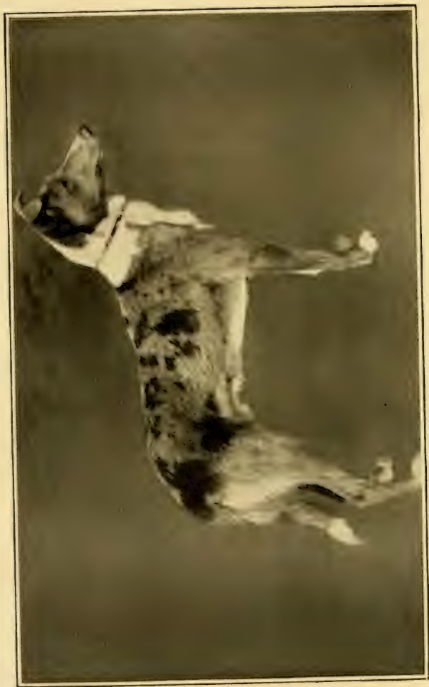
SMOOTH COATED COLLIE DOG.