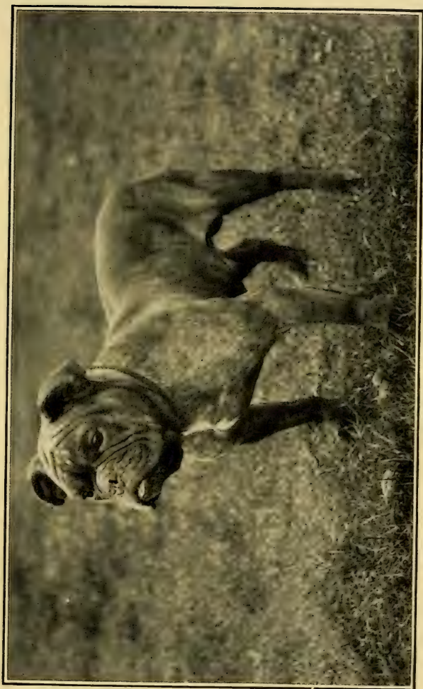
BRINDLED BULL DOG.