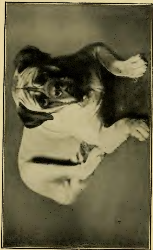
FAWN MASTIFF DOG.