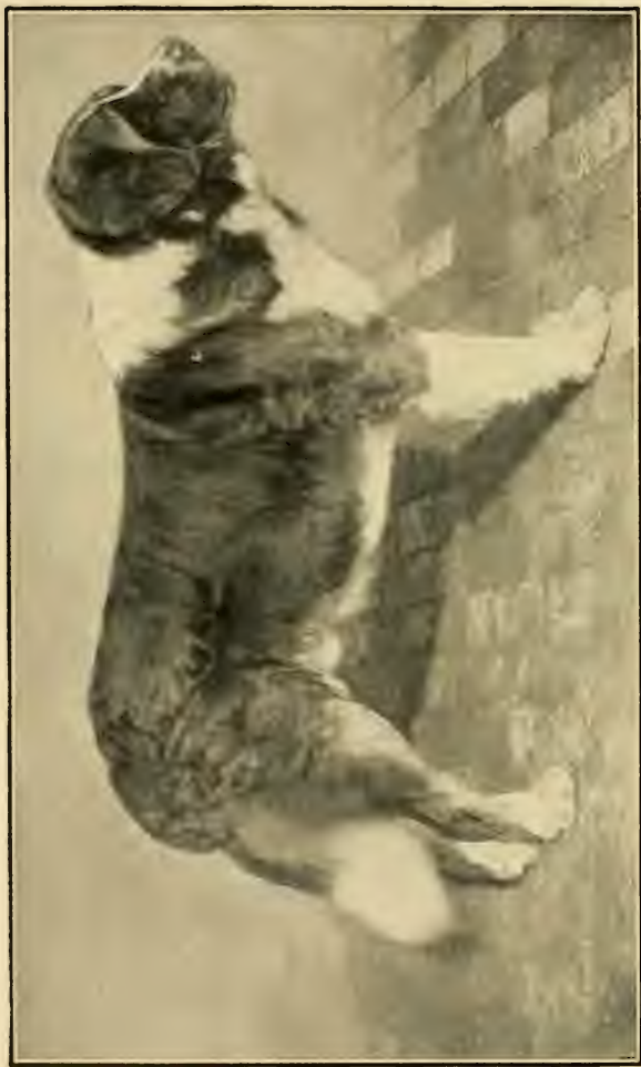
ROUGH COATED ST BERNARD.