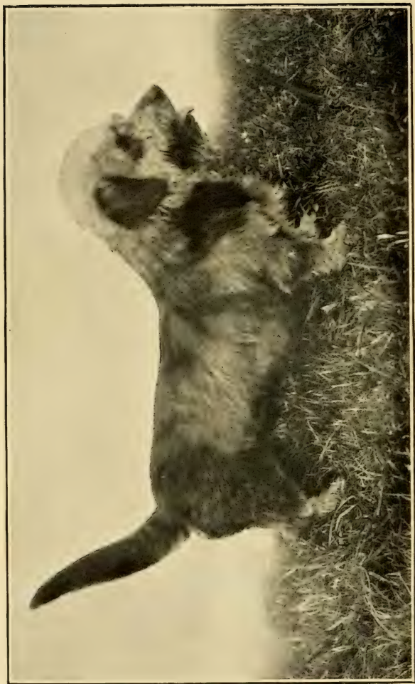
DANDIE DINMONT TERRIER DOG.