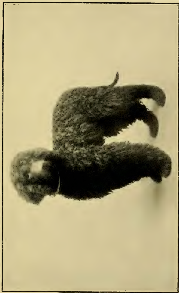
IRISH WATER SPANIEL.