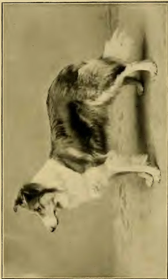
ROUGH COATED COLLIE.