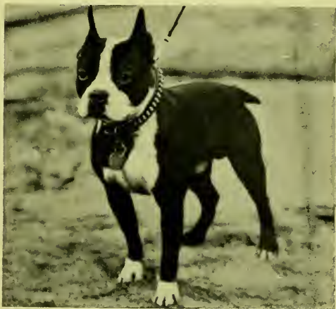
SIR BARNEY BLUE