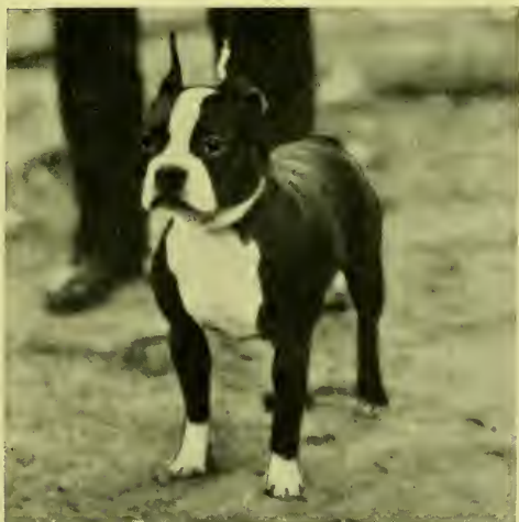
CHAMPION WILLOWBROOK GLORY