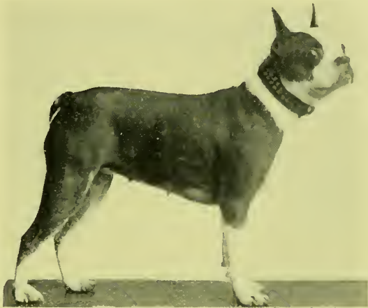
CHAMPION CADDY BELLE