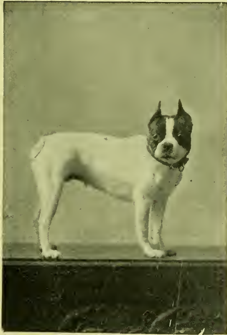
CHAMPION LADY DAINTY