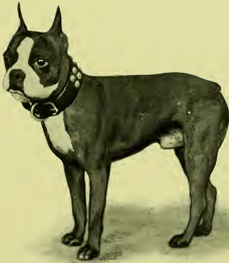
CHAMPION TODD BOY