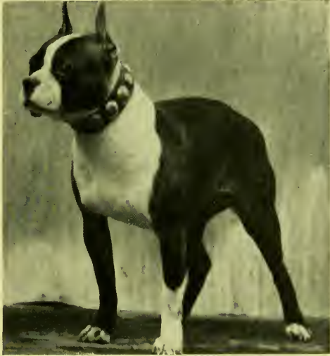
CHAMPION QUEENIE VI