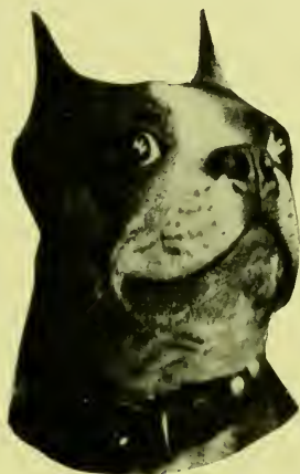
"RINGMASTER" Registered as Sport IV