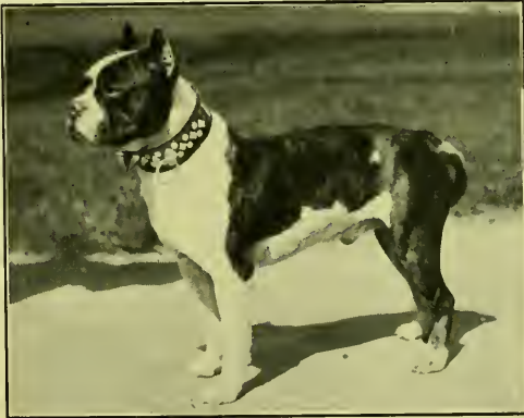
TOM SAYERS, One of the Pillars of the Breed