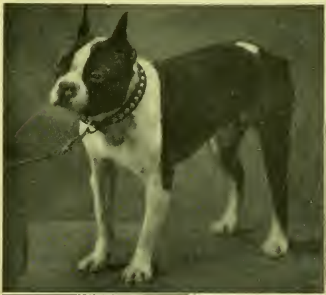
CHAMPION MISTER JACK