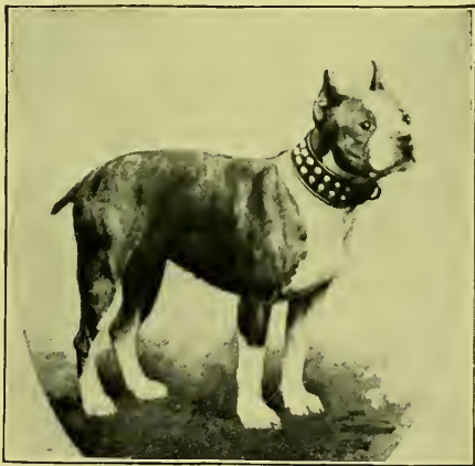
CHAMPION DRUID VIXEN