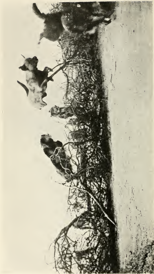
Training messenger dogs to cross barbed wire entanglements.