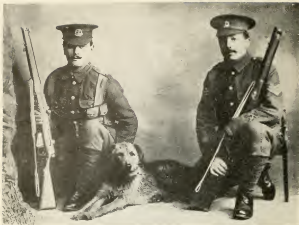
Sentry dog This dog went out with the Expeditionary Force in 1914, and was killed on the Aisne