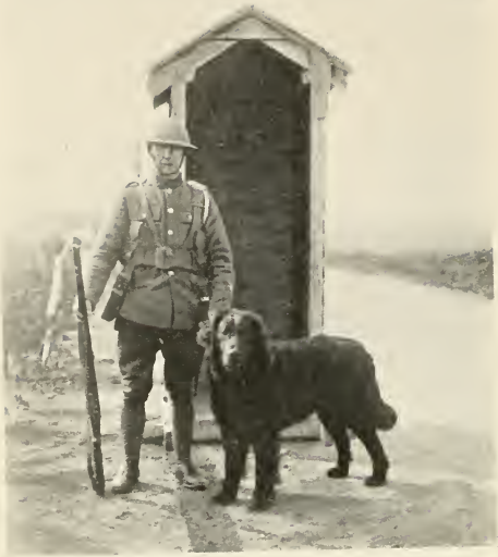
A sentry dog.