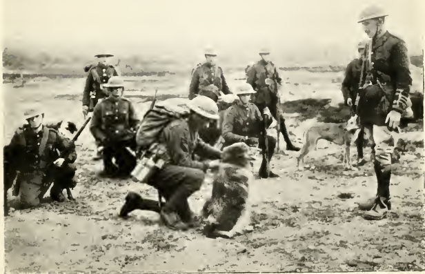
Arrival of dog with message for the Commandant brought from a point some miles off.