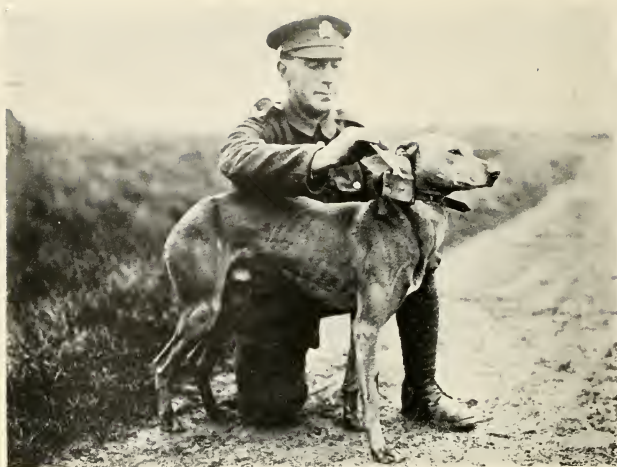
Messenger dog. Putting the message in the dog's collar.