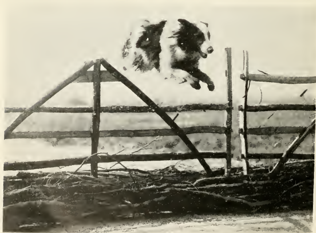
Training war dogs to cross obstacles