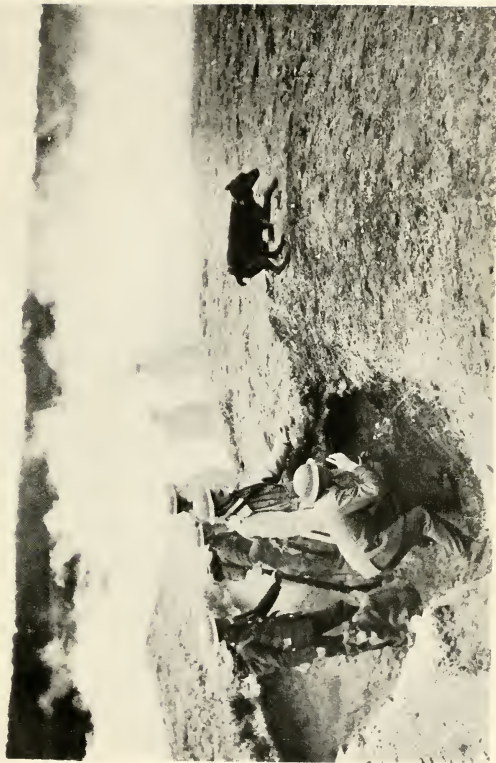
Training the messenger dog to go over the top.