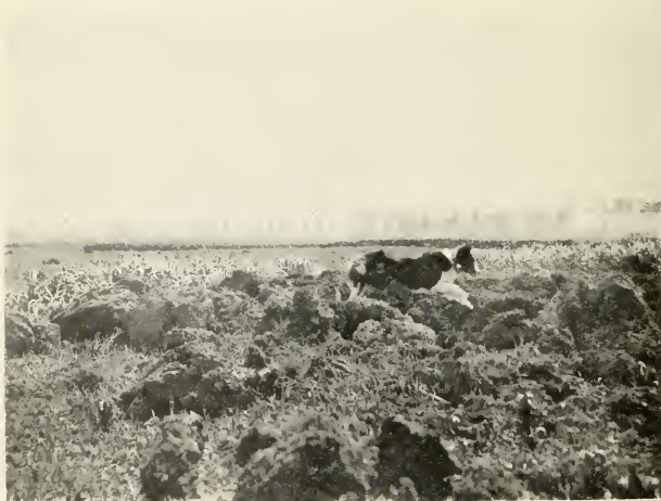
Messenger dog on Western Front going over shell holes,