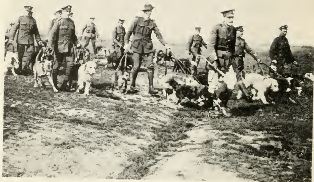
Off to the training ground.