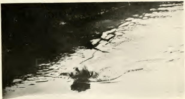
Messenger dog bringing a message across a canal on the Western Front.