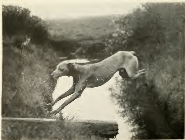
Training the messenger dog to water