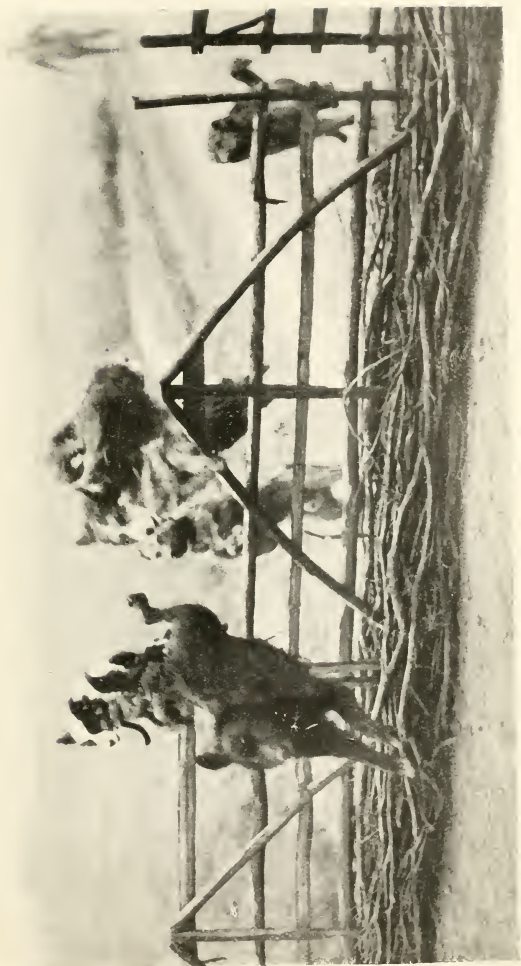
Messenger dogs clearing obstacles