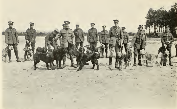
A group of trained guard dogs.