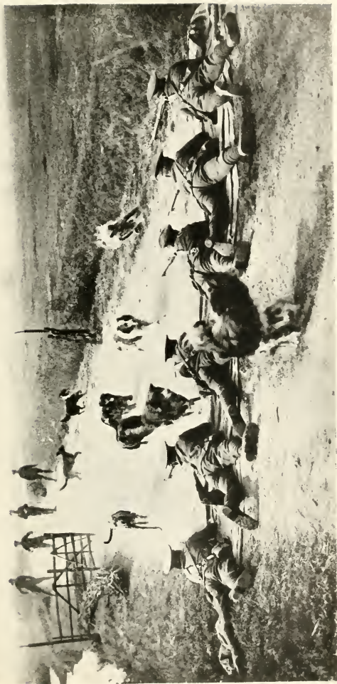
Training messenger dogs to rifle fire.