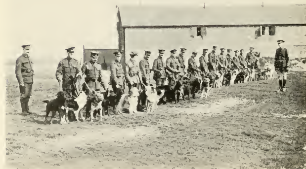
Morning parade of war dogs