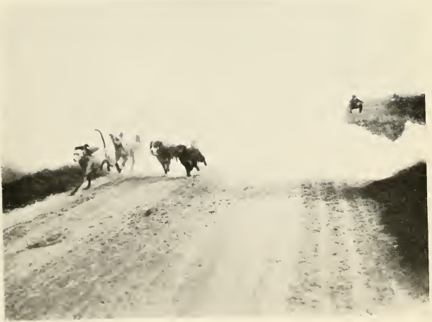
Training messenger dogs to the smoke barrage.