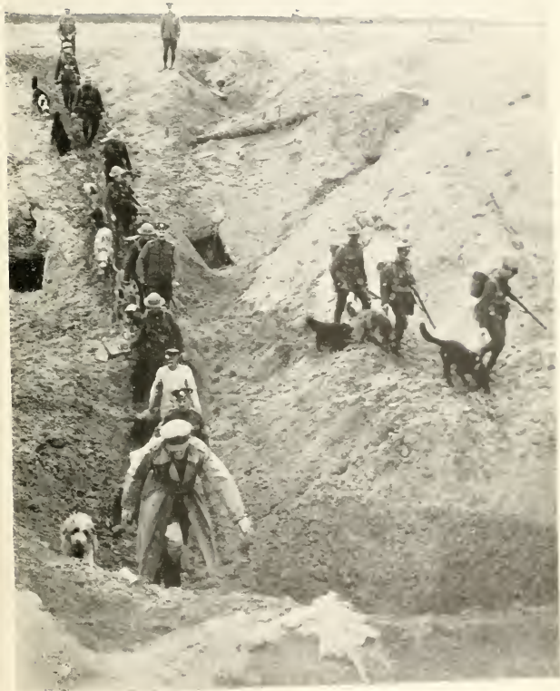
Part of the training ground at the War Dog Schools