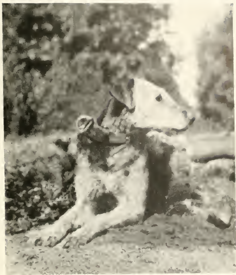
Sentry dog on duty.