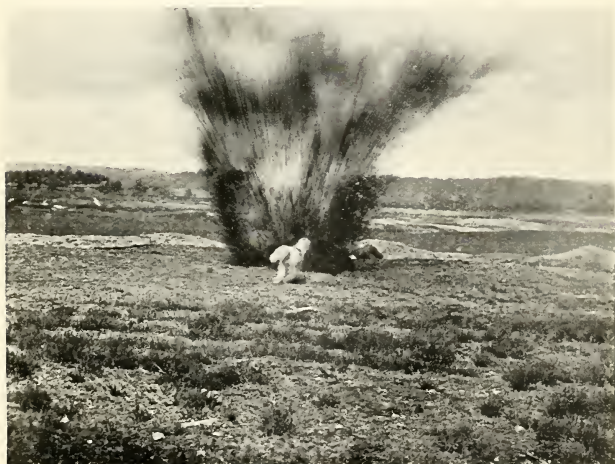
Training war dogs to shell-fire