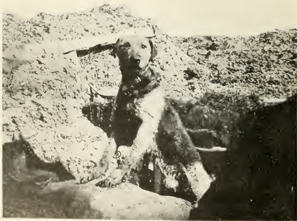
Sentry dog on Western Front, sent to Belgian Army in 1914.