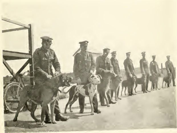
Morning parade of guard dogs.