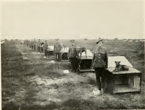
Type of kennel used.