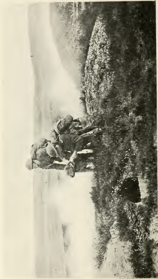
Sending off a message