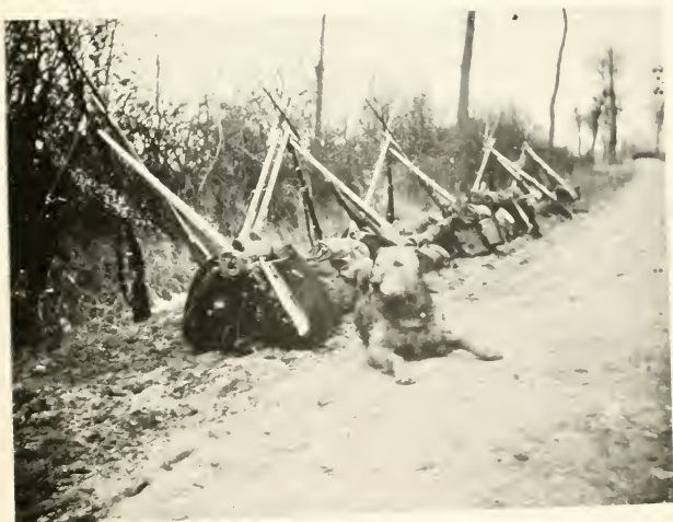
Sentry dog guarding kit on Western Front