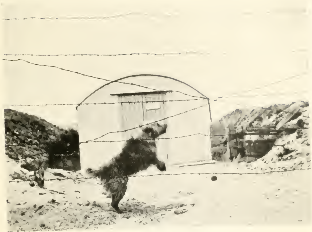
Guard dog guarding a magazine.